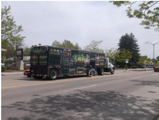
Need for delivery drop-off for many businesses.