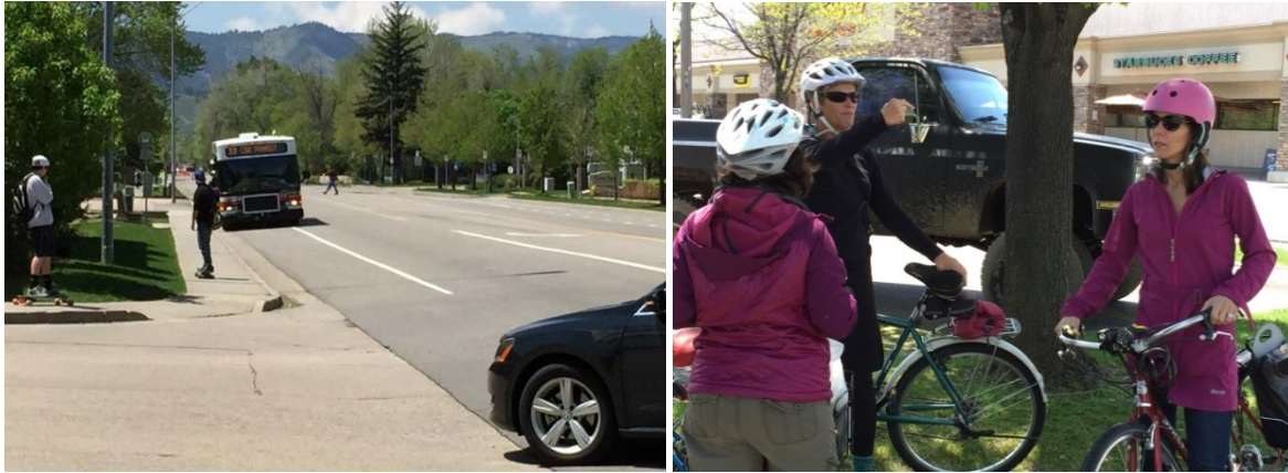
King Soopers Shopping Center at West Elizabeth and Taft Hill - many vehicle, bus pedestrian and bicycle conflicts due to the frequent left-turns into King Soopers.