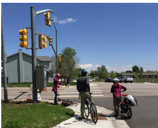
Plum and Taft Hill crossing – frequently used crossing to get to Lab/ Polaris School to the east.