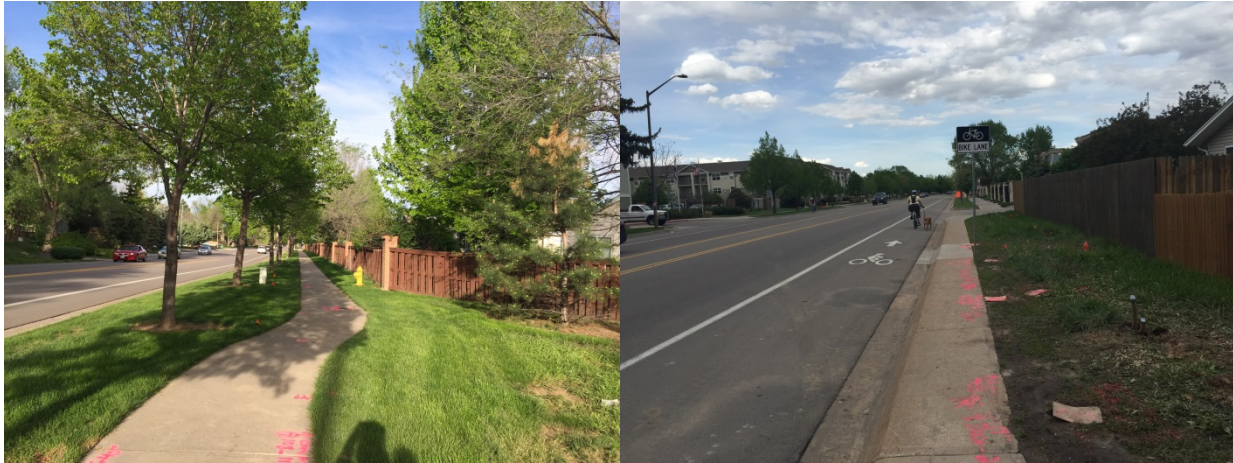
South side of West Elizabeth Street – sidewalk facilities are better than the north side of the street, but are still inconsistent.