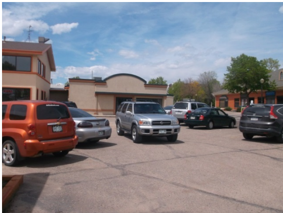
Parking challenges exist in the corridor.