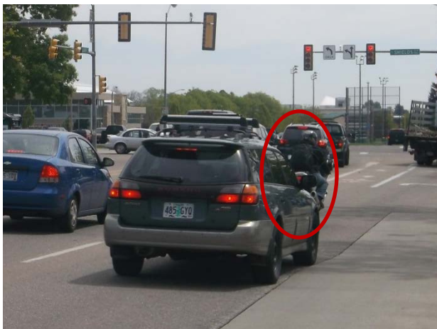
Bike and vehicle interaction as bike transitions through the turn lane into the bike lane at the intersection.