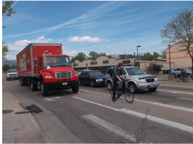
Vehicles crowding the bike lane at Elizabeth and Shields (eastbound travel).