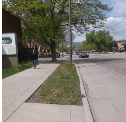
Landscape areas not being maintained.