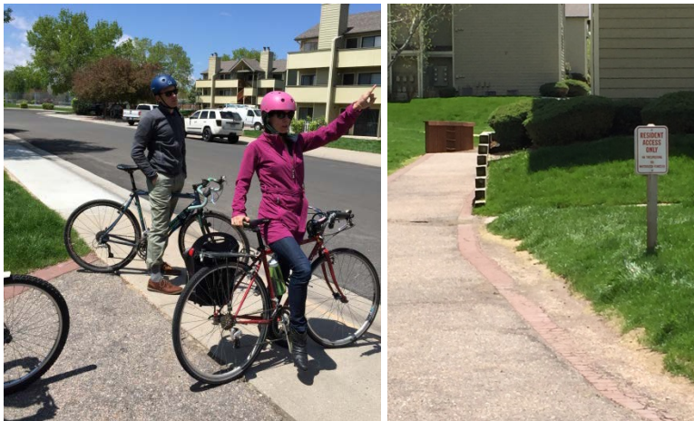
Common bike path through private development to avoid crossing at Taft Hill and West Elizabeth – signage indicates “Resident Access Only”.