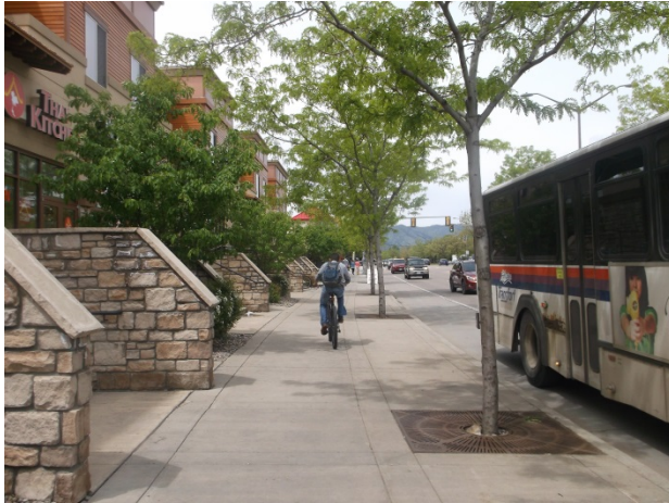
Bike traveling on the sidewalk, against traffic.