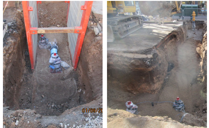
Tee assembly for new fire hydrant

On Thursday, the center of discussion in the field meeting (see photo) was the most efficient and least impactful way to restore the street after Utilities work is complete. A timeline for mill and overlay work will be decided next week.