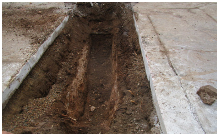
Service line excavation