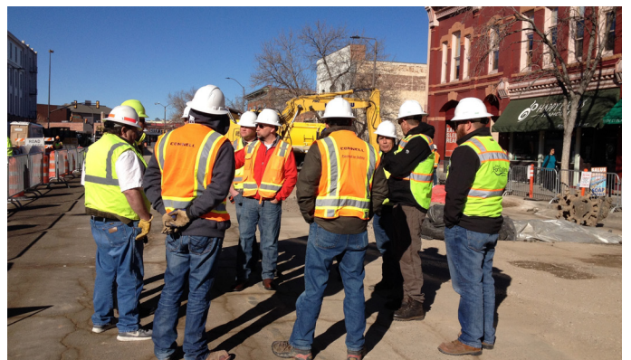
Jobsite meeting with Utilities, Ditesco, Connell and City Streets and Engineering