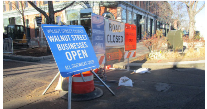
"Businesses Open" signage was posted this week.

Signage has been placed at all entrances to the jobsite noting that Walnut Street is closed but businesses are open. Impacted businesses are invited to supply their own sign that will be placed on fencing by the project manager.