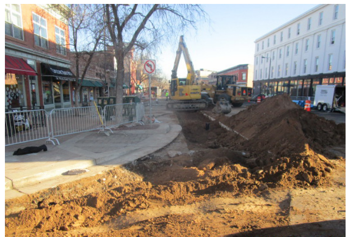
Backfill after pipe installation