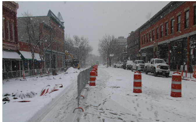
Snowy morning on MLK Day

Last week, as Connell was excavating for service lines, crews discovered old street trolley tracks under Walnut Street. The City's Historical Society has visited the site to document the find and you'll see an article in the Coloradoan about this discovery in the near future. The iron rails, stamped bricks and ties will be removed and some will be salvaged for their historical significance. Connell will make the concrete repairs to the street.