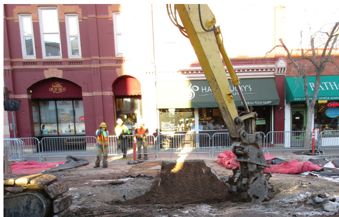
Service line backfill