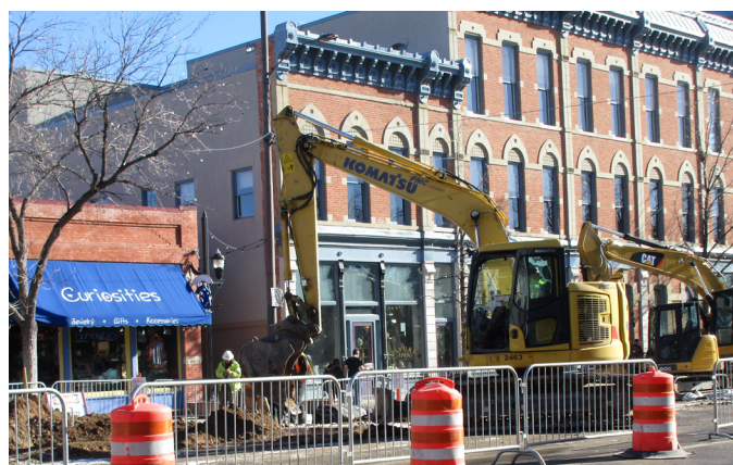
Service line excavation