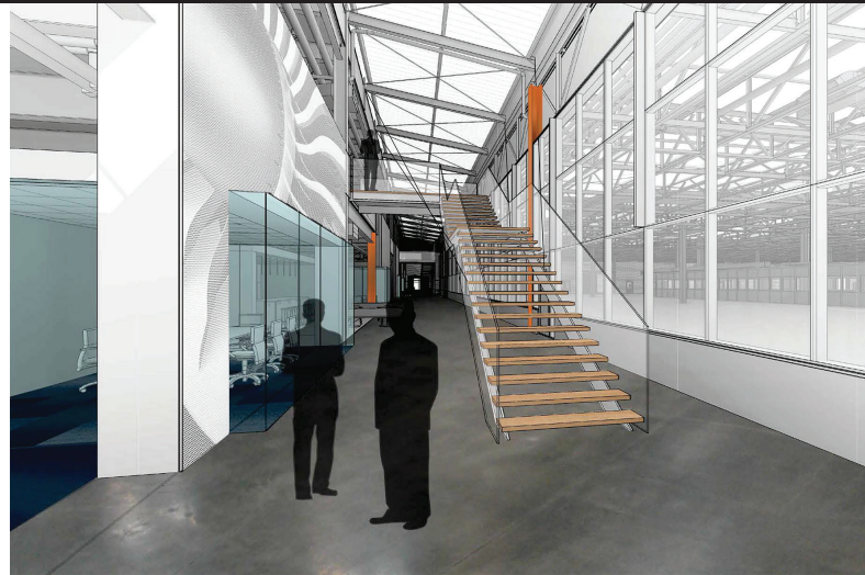
Daylighting is used throughout the building. The silver maple stair treads were harvested from the building site.

For project updates and questions, contact Julie Sieving at Brendle Group, 970-207-0058 or JSieving@BrendleGroup.com .