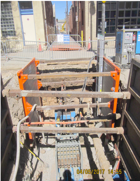
Bursting rods are pulled from Walnut through the alley for the new sewer main.