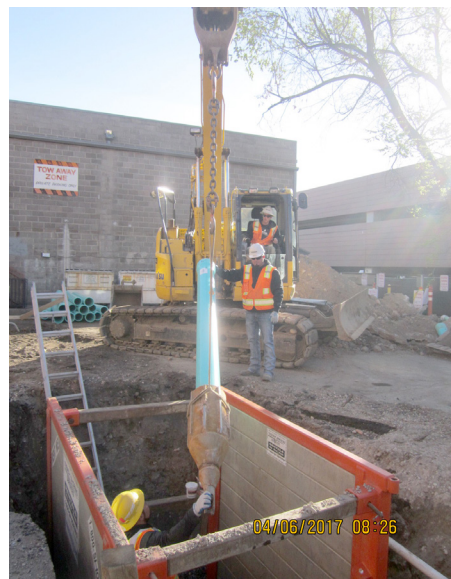
Sewerpipe being lowered into pit to be pushed through for new main.