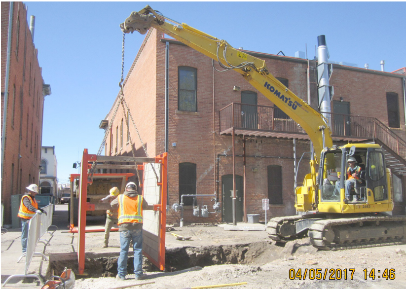
Setting the trenchbox to begin service connection and manhole work near Prost at the end of Seckner Alley.

WHAT'S NEW? Walnut Street should be backfilled by next Friday, but not yet open due to safety reasons. We are on track for completion and opening the street by April 20.