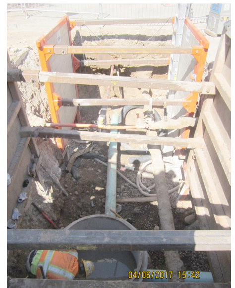
Setting one of three new manholes to connect to the new sewerline.