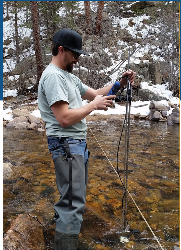
Measuring streamflow on the Little South Fork

For more information about contaminants and potential health risks, call the Safe Drinking Water Hotline at (800) 426-4791 or visiting epa.gov/safewater .