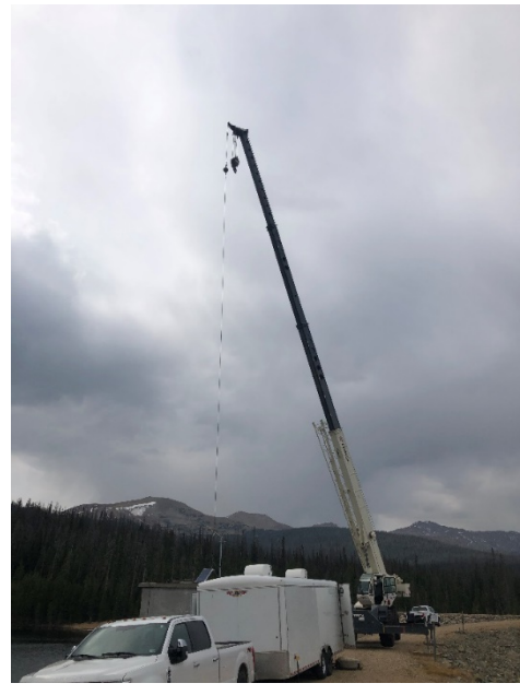
Crane on top of dam used to lower men into work area, 120'

Inspiring words come to mind following the success of this project: safety, ingenuity, collaboration, cross-departmental cooperation/support, risk management, advance planning, teamwork, critical/effective communication – having the right people on the job. In addition to 'within budget' and 'on time'! Well done, Amy, Ross and team!