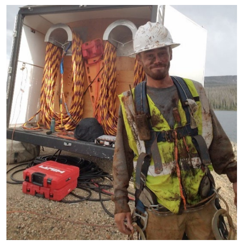
It was a dirty job.