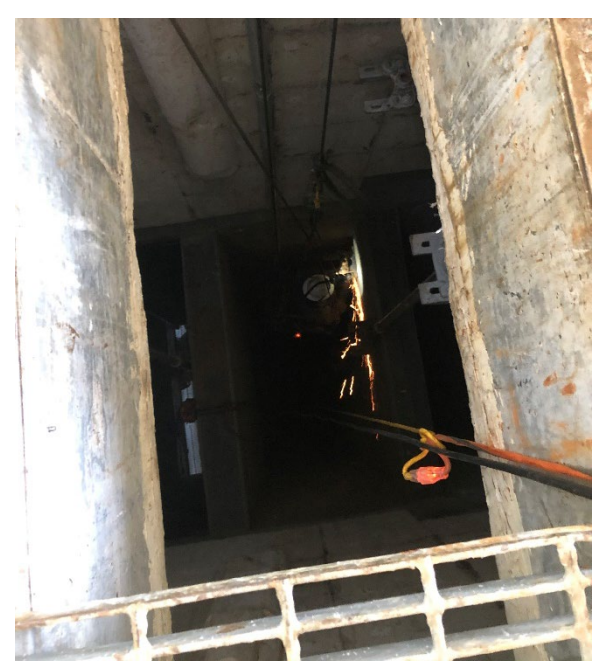
Going down into the shaft.