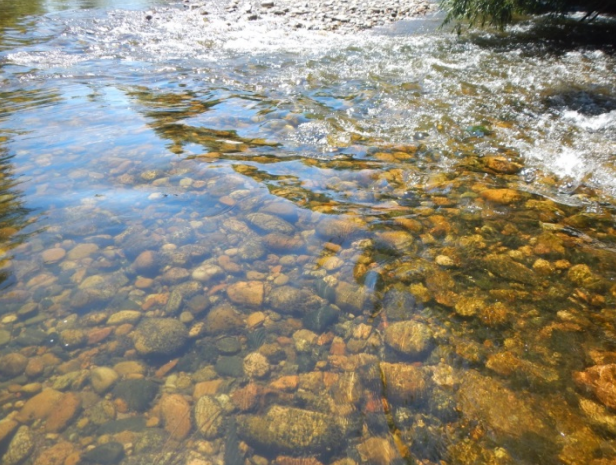
Figure 3 - Riffle Downstream of Timberline Road

To be effective in meeting the agencies' objective, the bed material matrix must be mobilized to flush the finer sediments that have settled in and behind the larger materials, as defined above. The standard approach within the discipline of geomorphology is to calculate and work to mobilize the