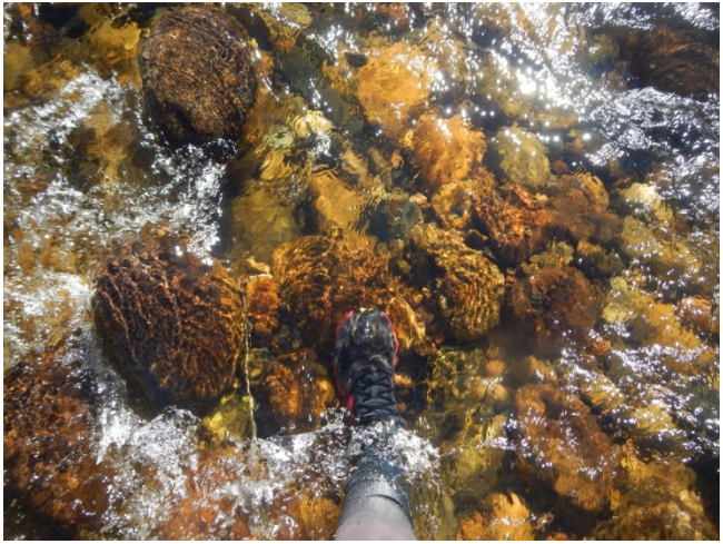
Figure 1 - Riffle downstream of the Greeley Filter Plant.