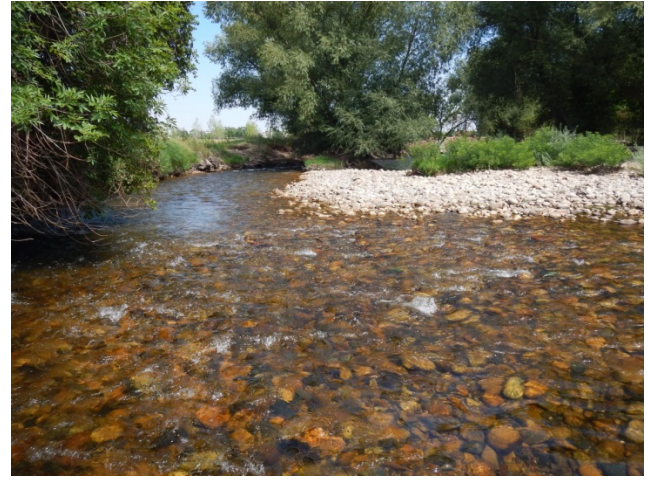
Figure 2 - Riffle just upstream of Mulberry Wastewater Treatment Plant