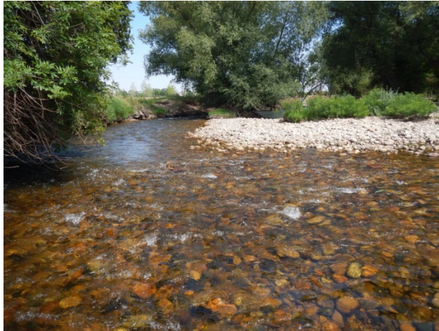
Figure 2 - Riffle just upstream of Mulberry Wastewater Treatment Plant