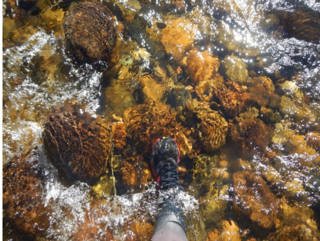
Figure 1 - Riffle downstream of the Greeley Filter Plant.