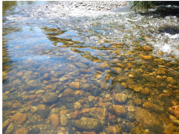
Figure 3 - Riffle Downstream of Timberline Road

To be effective in meeting the agencies' objective, the bed material matrix must be mobilized to flush the finer sediments that have settled in and behind the larger materials, as defined above. The standard approach within the discipline of geomorphology is to calculate and work to mobilize the