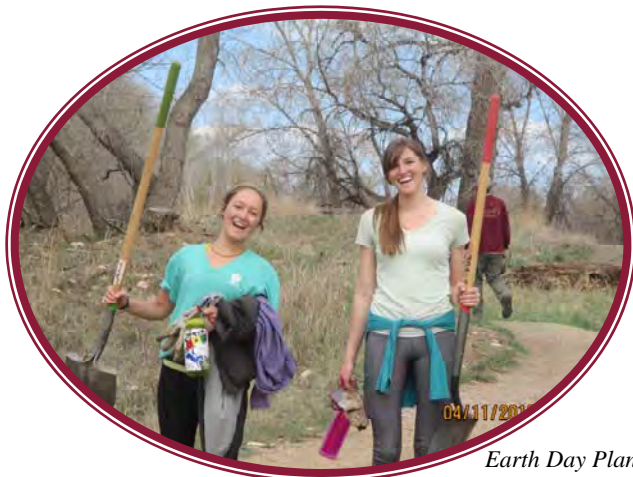
Earth Day Planting