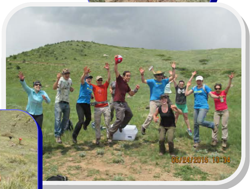
REI jumps for joy at Soapstone Prairie Natural Area