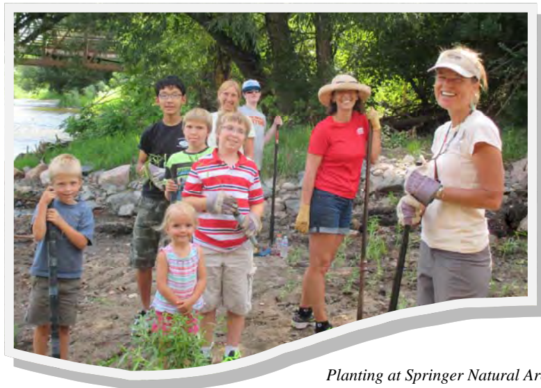
Planting at Springer Natural Area