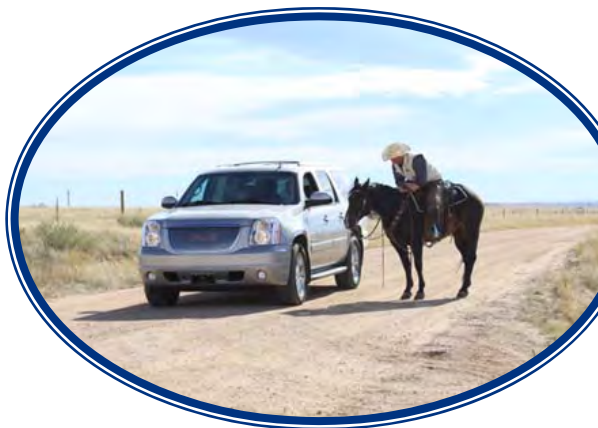
VRA Brent Bearden greets visitors at the bison release at Soapstone Prairie Natural Area, November 1, 2015.