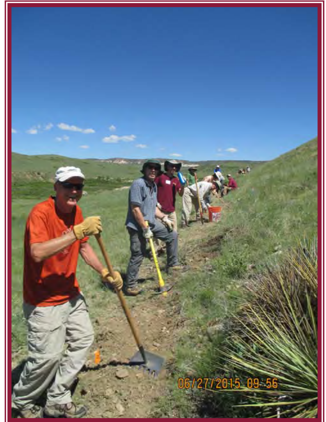
National Trails Day at Soapstone Prairie.

Have a wonderful winter. Rest up –there is more work to be done next year!