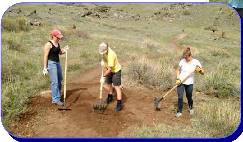
Trailcology works at Bobcat Ridge Natural Area; photo by Chris Heron.