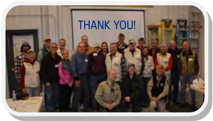
VRA class of 2015

As the year drew to an end, we tallied the numbers over and over again in disbelief. VRAs had shattered previous year's numbers! This stalwart crew of dedicated individuals managed a 30% increase in hours spent in the natural areas and open spaces, and an incredible 55% increase in number of contacts with the public. We consider these numbers an indicator of the increase in visitor use and popularity of these lands. VRAs continue to step up to the challenges of greeting our visitors and maintaining a positive relationship with an ever-increasing population who enjoy where they live and play.