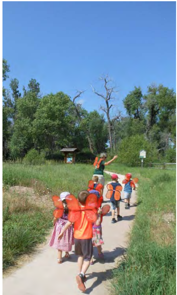
Butterflies on the trail!