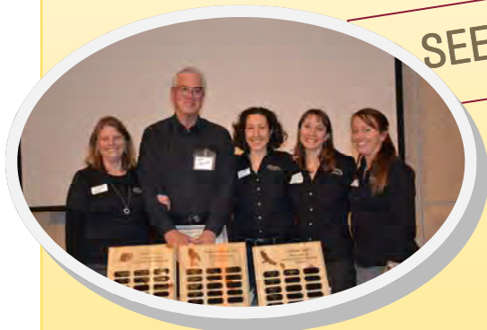
Volunteers enjoy the festivities at the Annual Volunteer Appreciation Dinner, 2015.