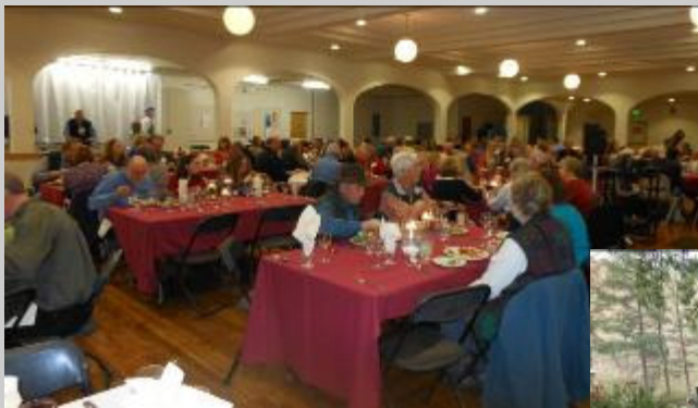
Volunteers enjoy the festivities at the Annual Volunteer Appreciation Dinner in January, 2012.

RSVP required. Watch your email for an invitation after the holidays.