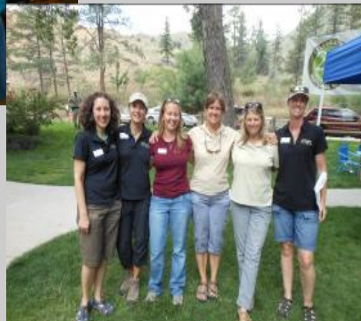
Education staff at Volunteer Appreciation Picnic in August, 2012.