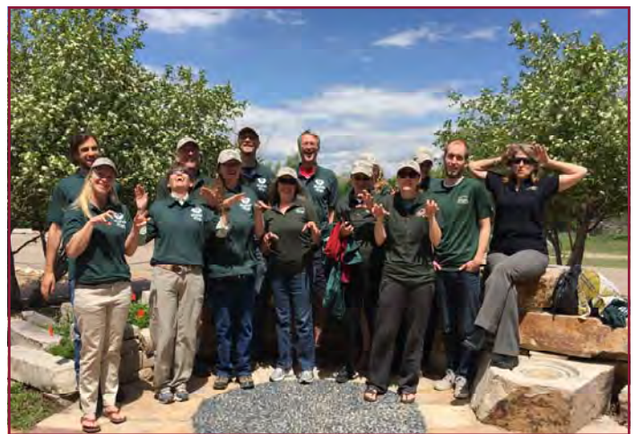
Master Naturalist Assistant Class of 2016 at Nix Farm.