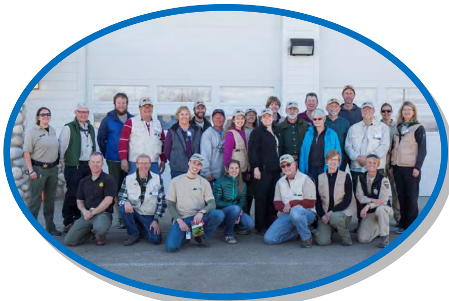
VRA CLASS OF 2016

February brought us another contingent of enthusiastic, wonderful people who wish to contribute to Natural Areas and Open Space by volunteering as a front-line contact with visitors. They call themselves Volunteer Ranger Assistants and twenty three of them were trained early this spring.