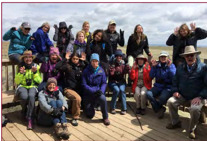
Master Naturalist Class of 2016 at Coyote Ridge Natural Area.