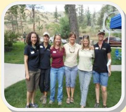
Education staff enjoying the Volunteer Appreciation Picnic in August, 2013.