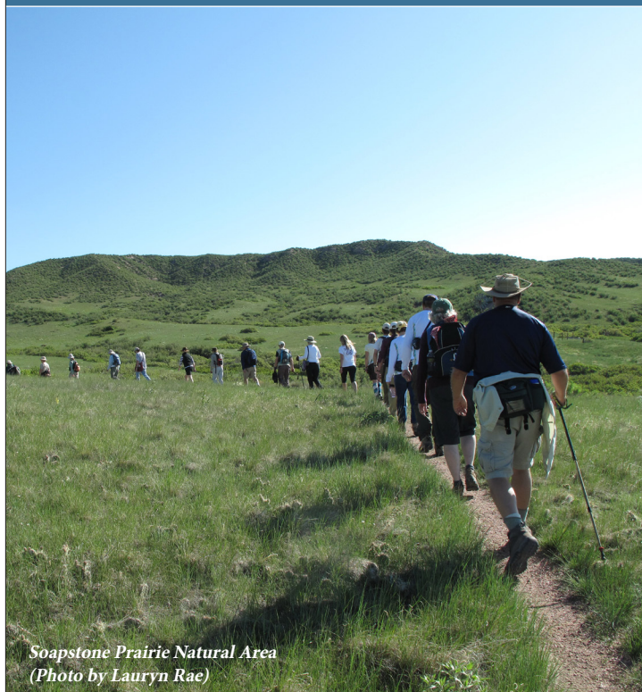
Soapstone Prairie Natural Area

The Master Plan proposes many solutions such as: acquiring more land and developing more trails, monitoring visitor use, improving site access, escalating educational outreach, improving natural surface trail sustainability and connectivity, and resolving multiuse conflict. In addition, this Master Plan expands the spectrum of recreational offerings on select natural areas to include sport and family-friendly fishing, areas for solitude, off-trail nature exploration, natural play areas for children, and limited hunting opportunities.