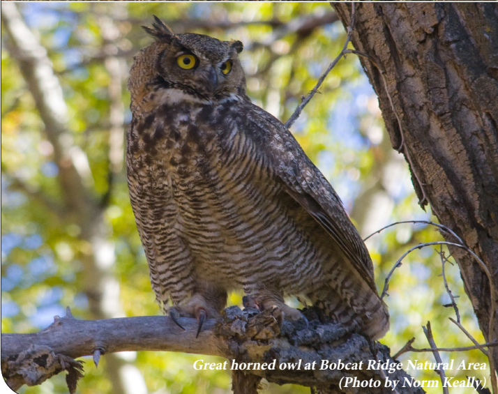
Great horned owl at Bobcat Ridge Natural Area