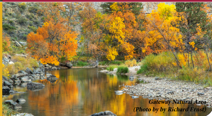
Gateway Natural Area

Global climate change and extreme weather events are expected to increase and the impacts on natural resources will be profound, including shifts in plant and animal communities, increased fire and flood events, and alteration in the Cache la Poudre water temperature, flows, and water quality and quantity. Land conservation and restoration could play a role in mitigating the effects of local climate change.