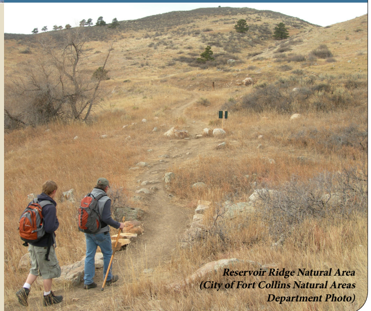
Reservoir Ridge Natural Area

The City is passionate about providing enjoyable and sustainable opportunities for the public to enjoy the natural and cultural treasures it manages. Natural Areas public improvements staff will maintain a natural surface trail system that supports a variety of recreational experiences, while minimizing multiuse conflicts and negative impacts on conservation values. Rangers will continue to provide visitor services and enforcement to protect resources and maintain safety. Illegal camping issues will be addressed through collaboration with the Social Sustainability Department, Police Services, and community social service organizations. Maintaining high quality customer service, as measured by Citizen Survey reports, is a key metric of success.