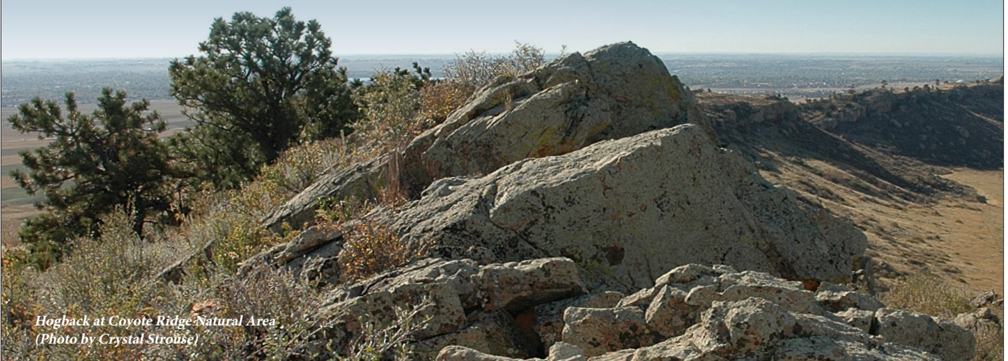
Hogback at Coyote Ridge Natural Area