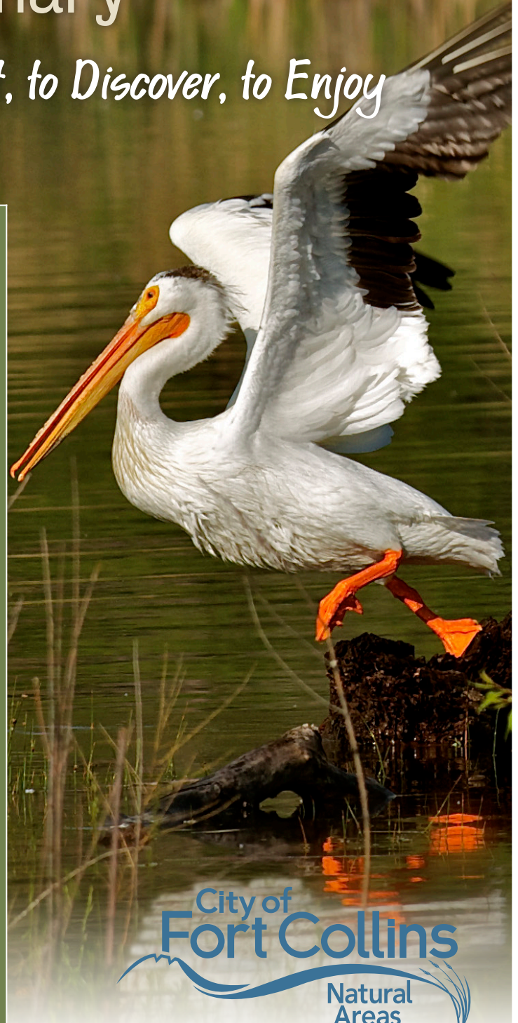
White pelican on McMurry Natural Area

Fort Collins' natural areas are an extraordinary expression of our community's commitment to biological diversity, environmental protection, and human wellbeing. And – as demonstrated by the September 2013 flooding – natural areas help mitigate potentially disastrous flood flows, indicating how important natural areas are to our economic resiliency and safety.