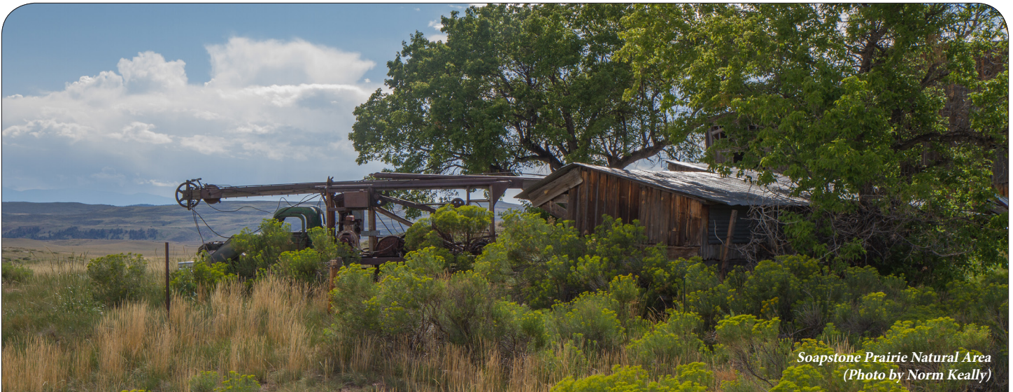
Soapstone Prairie Natural Area