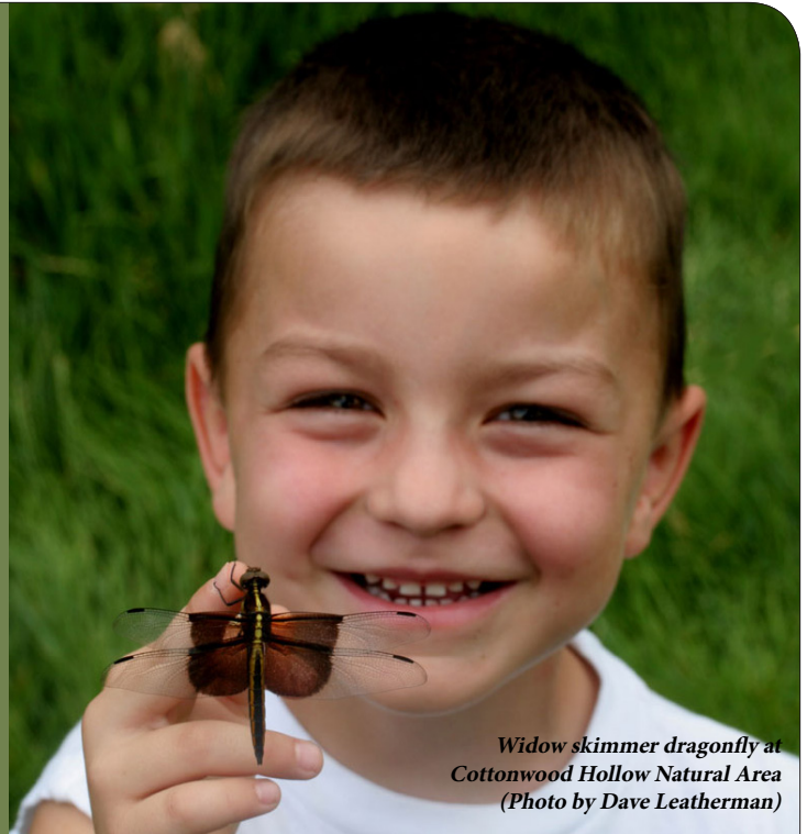
Widow skimmer dragonfly at Cottonwood Hollow Natural Area