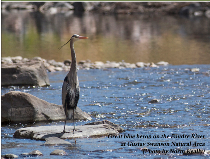
Great blue heron on the Poudre River at Gustav Swanson Natural Area