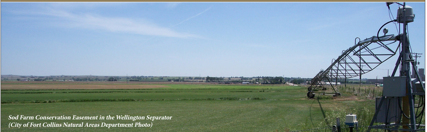
Sod Farm Conservation Easement in the Wellington Separator

The Department will seek to utilize non-Departmental resources, including grants, to conserve and restore cultural resources. It also will develop policies to guide its work to fund and manage cultural resources; and, it will pursue state or federal historic designation for noteworthy structures, such as the Warren Ranch buildings on Soapstone Prairie Natural Area.