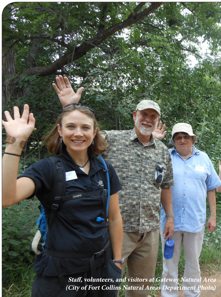
Staff, volunteers, and visitors at Gateway Natural Area