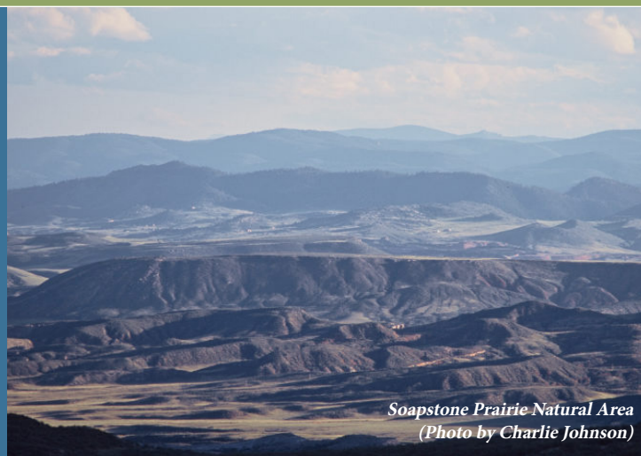
Soapstone Prairie Natural Area

Larimer County Commissioners have placed an extension of HPOS on the November 2014 ballot.