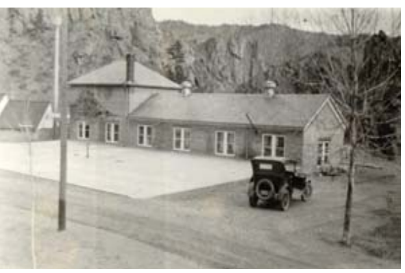
Original treatment plant.

charcoal. The water was fluoridated and chlorinated before final delivery to homes in Fort Collins. The land around the plant was maintained as a park and open to the public.