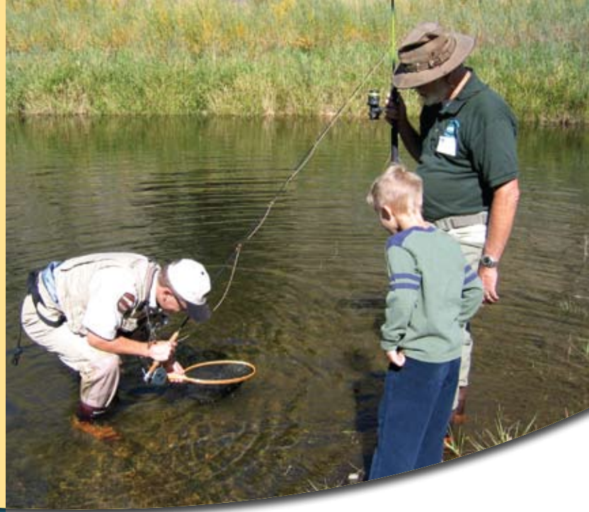
Fishing at Gateway

In 2007 over 4,000 hours were donated to the Natural Areas Program. Volunteer activities included 65 Master Naturalists providing 219 educational programs serving 9,481 people. This is a 62% increase over 2006 participant numbers! Trail Hosts donated almost 600 hours greeting and assisting visitors and monitoring trails. Volunteers kept natural areas free of litter by adopting 21 sites. Other volunteers hand-pulled invasive weeds at Soapstone Prairie and Bobcat Ridge natural areas, built bat and flicker houses to be distributed to the public, maintained the native plant garden at Nix Natural Area, packaged wildflower seeds, conducted bird surveys and more. A sincere thank you to our wonderful volunteers for their stewardship and involvement! To volunteer, contact Susan Schafer, 970-416-2480, sschafer@fcgov.com .