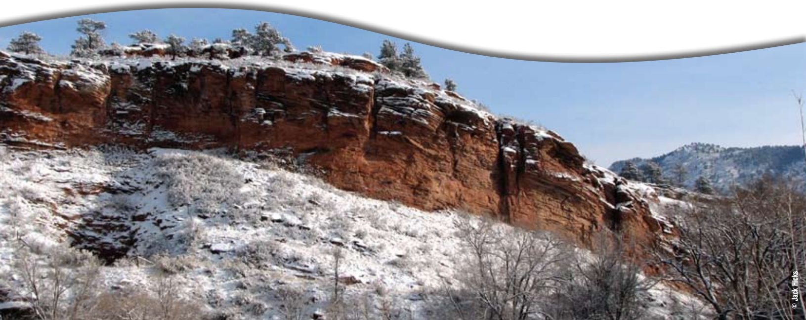
Bobcat Ridge Natural Area

The mission of the Natural Areas Program is to conserve and enhance lands with existing or potential natural area values, lands that serve as community separators, agricultural lands, and lands with scenic values. Conservation of natural habitats and features is the first priority, while providing for education and recreation for the Fort Collins community.