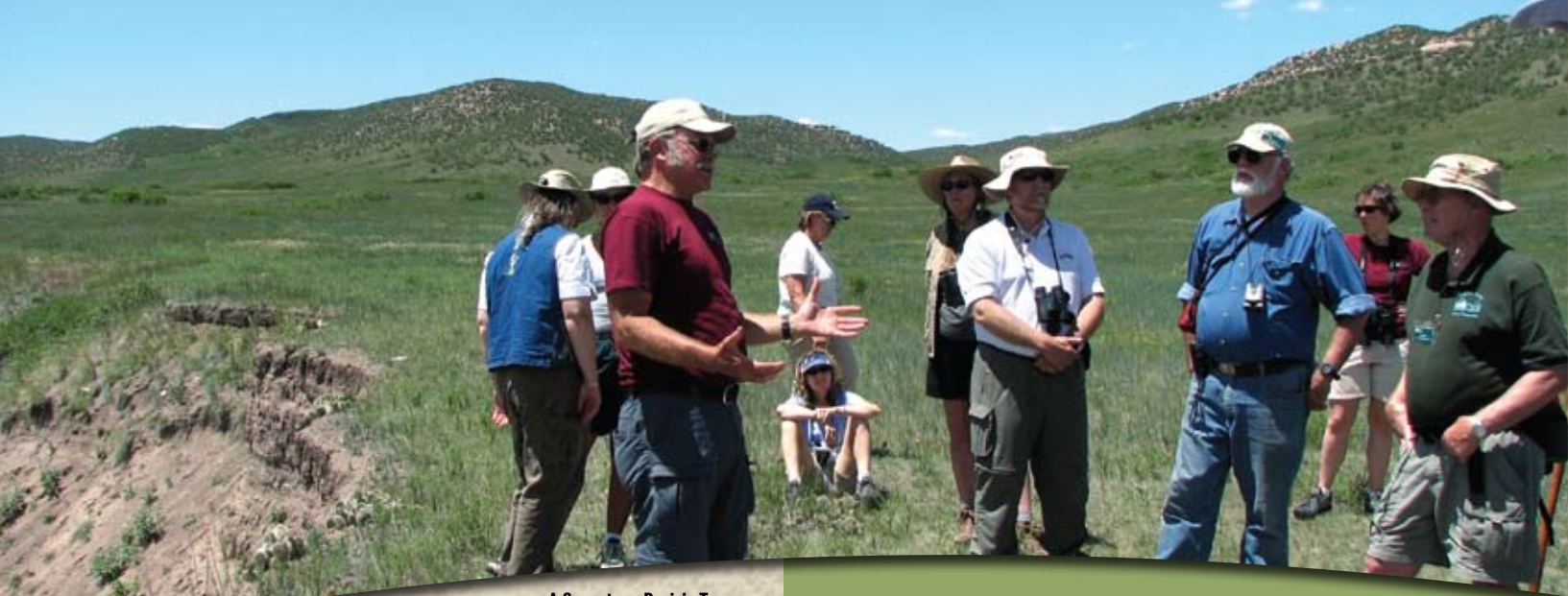
A Soapstone Prairie Tour