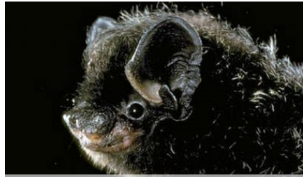
Silver-haired bat

Eighteen species of bats live in Colorado and they all eat insects. Bat species are hard to tell apart but learning a few facts will help you distinguish them. The most likely bats in the Fort Collins area are below.