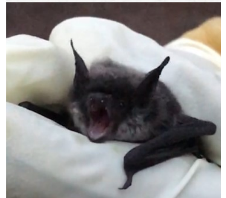
Little brown bat; Natural Areas