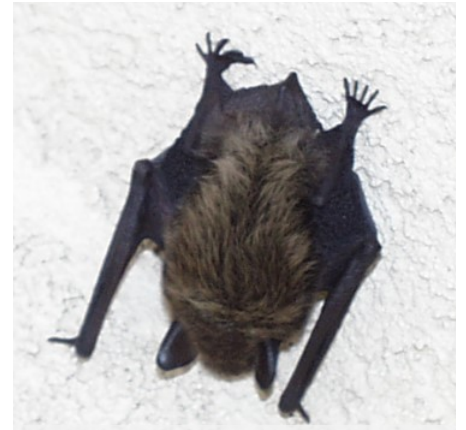
Big brown bat; Natural Areas

Call the Larimer Humane Society at 970-226-3647 for assistance.