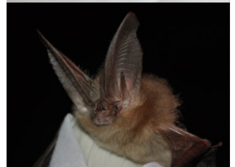
Townsend's big-eared bat