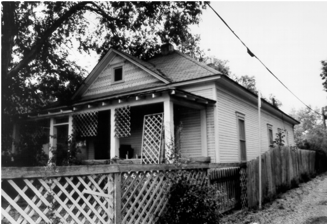
Figure 23. 409 Linden Street (5LR10354), looking west.

Description: (Note: the following description and historical summary were written by CSU students Linda McGehee and Ryan Nutting.) This small house (Figure 23) is located approximately one half block north of the intersection between Willow Street and Linden Street. It is the middle of three houses on this block and is bordered to the northeast by a small alley (Poudre Street). The lot is bordered on the northwest side by a large garage complex. The house is a small, one-story residence with a rectangular plan, and a hipped roof. The outside of the building is covered with narrow, horizontal beige clapboard siding. The front of the residence consists of an attached open porch, which runs the entire width of the home. The roofs of the porch and of the home are covered with beige asphalt shingles.