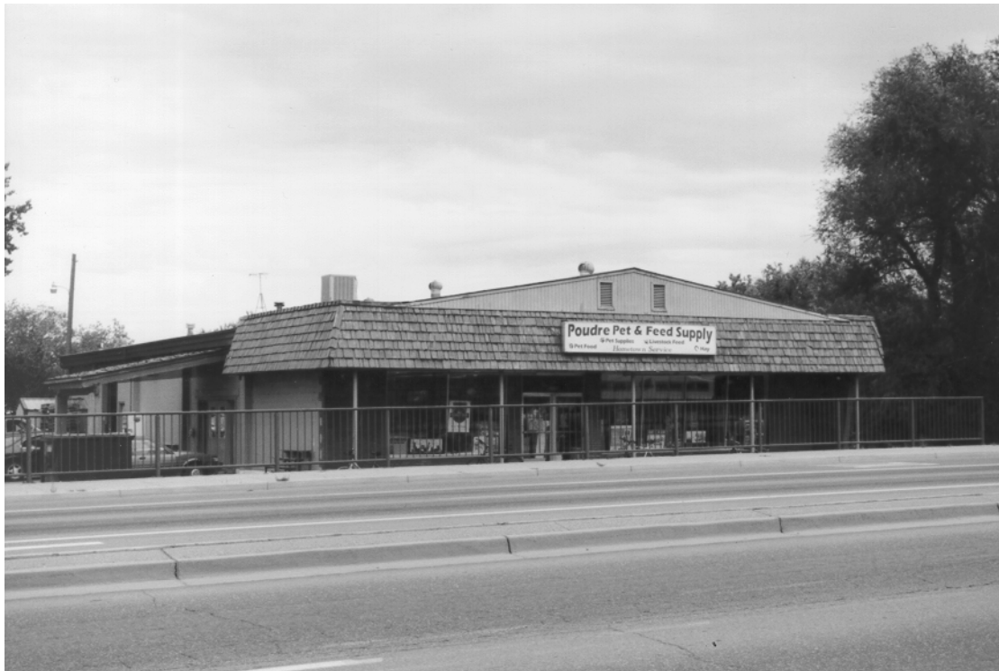
Figure 7. 620 N. College Avenue (5LR10297), looking southeast.

full-width open front porch. The awning structure wraps around partially onto the north and south sides of the building. The storefront consists of a glazed entry with two (presently unused) aluminum frame glass doors set beneath a large aluminum frame transom. The entry is flanked by large fixed metal frame display windows, two to the left and four to the right. These display windows have sheet metal clad sills. At the south end of the façade is a projecting brick wall that delineates the end of the porch. A concrete walkway extends along the façade and along the north side of the building.