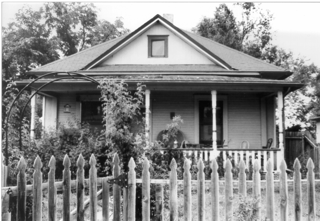
Figure 21. 405 Linden Street (5LR10353), looking northwest.

Description : (Note: the following description and historical summary were written by CSU students Linda McGehee and Ryan Nutting.) This small, rectangular frame house is located on the northwest side of Linden Street (Figure 21). One building, currently occupied by the Education and Life Training Center, stands to the southwest between the house and the intersection of Linden and Willow Streets. The neighboring house to the northeast on Linden Street has a nearly identical building plan and was built in the same year. A chain link fence separates the back yards of the two houses, and a six foot tall privacy fence runs between the structures. This privacy fence descends into a four foot tall wood slat fence, which continues from the front porch toward the sidewalk. A four foot tall picket fence runs along the sidewalk to the south corner of the front yard.