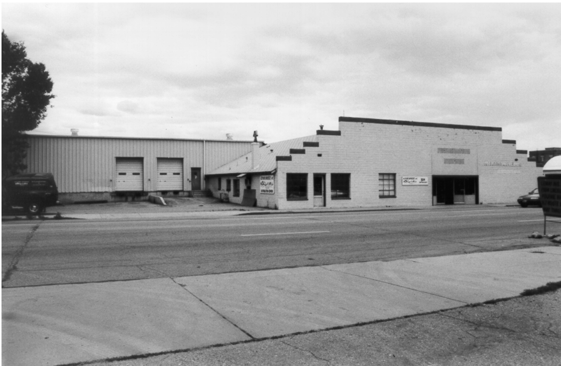
Figure 10. 324 Jefferson Street (5LR10299), looking east.

Description: This property, located on the northwest side of Jefferson Street, consists of a large, one story tile block commercial building with an attached, perpendicular modular sheet metal warehouse wing (Figure 10). The older, tile block building is an extremely wide, low-slung structure with a stepped, flat parapet on its façade, and a gambrel roof clad with asphalt shingles and exposed rafter tails beneath the eaves. The building is devoid of ornamentation, and presents a utilitarian appearance.