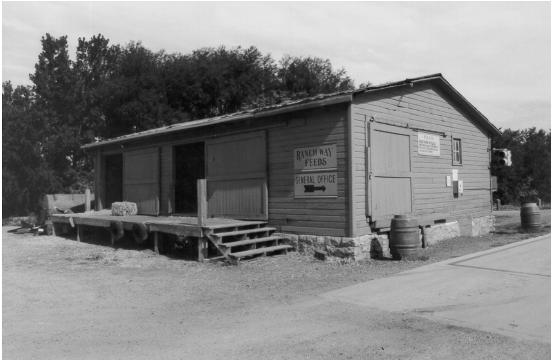
Figure 24. 416 Linden Street (5LR10309), looking east.

The front of the building faces Linden Street. An elevated wooden platform extends along \frac{3}{4} of the façade. This platform is constructed of heavy timbers and planks, and is accessed via a set of wooden steps. The front of the building contains two large openings sealed with original sliding wood doors. These doors are constructed of vertical boards braced with horizontal boards, and are hung from a solitary sliding rail affixed to the front of the building. A similar sliding door is present on the right side of the structure, along with a small, fixed, 4-light window. The opposite/left side lacks doors but is fenestrated with two small, identical 4-light fixed windows. The building is presently used to store bales of hay.