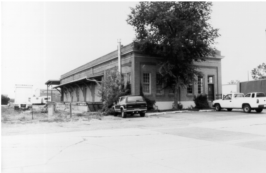
Figure 17. 350 Linden Street (5LR462.19), looking south.

Description: This historical freight depot is a large, rectangular plan, tall, one story warehouse building with walls constructed of red brick set in common bond (Figure 17). The building, although relatively plain, appears to incorporate Beaux Arts design traits, including symmetry, monumentality, and the use of stylized pilasters on the façade. The depot is oriented with its long axis parallel to the railroad tracks. The building rests on a concrete foundation that rises approximately 3 feet above grade.