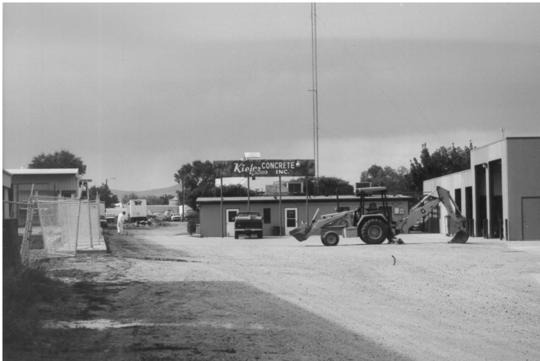
Figure 18. 360 Linden Street (5LR10305), looking northwest.

The main entry is located on its northwest side, and consists of a vestibule equipped with a glazed wooden door. Two plain entries are placed on the rear elevation. A distinctive sign is installed adjacent to the back side of the building, consisting of a painted sheet metal signboard supported by four tall metal poles that raise the sign above the height of the office roof. A tall metal radio communication antenna is mounted on the roof, and also supported by guy wires.