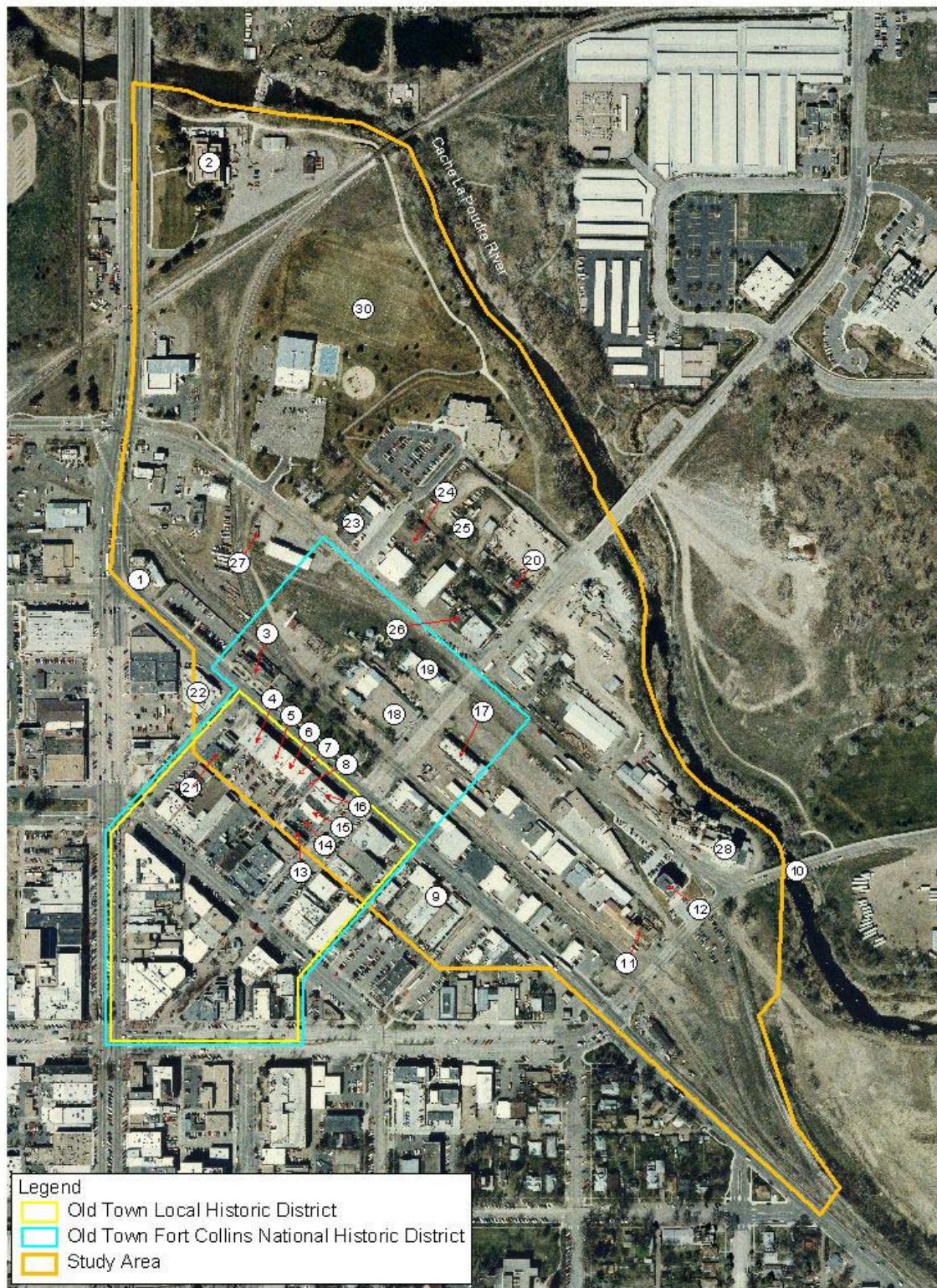
Figure 2. Locations of Previously Recorded Cultural Resources in the Old Fort Site.