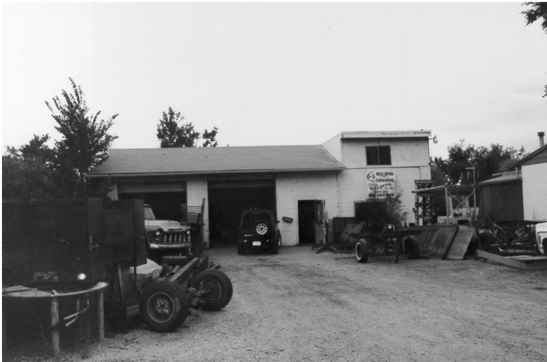
Figure 32. 209 E. Vine Street (5LR10317), looking south.

Description : This property is a single story, side gabled, concrete block garage/shop building (Figure 32). The utilitarian structure has a rectangular plan, and is devoid of ornamentation. The building has walls constructed of concrete block masonry, painted white. A low-pitched, side gable roof covers the structure, and is clad with asphalt shingles. The eastern 2/3 of the structure is occupied by two vehicle bays, each accessed via a tall opening sealed with a modern roll-up sheet metal door. To the right (west) of the garage area is a personnel entry and a large window covered by a diamond pattern steel security grate.