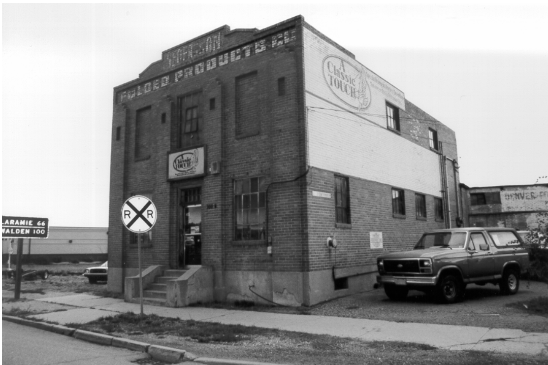
Figure 4. 300 N. College Avenue (5LR1502), looking northeast.

Description: This property is a two story, brick commercial/industrial building with an attached, one story, sheet metal-clad southeast addition, and an enclosed freight elevator attached to the back of the building (Figure 4). The building rests on a concrete basement. The basement wall rises approximately three feet above grade, and contains a series of small openings fitted with fixed, 3-light steel sash windows. The building is constructed of pressed red brick, set in common bond.