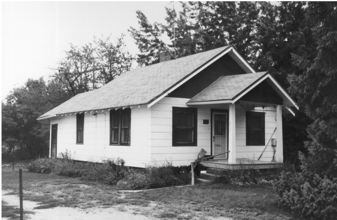
Figure 33. 213 E. Vine Street (5LR10318), looking southwest.

The east elevation is fenestrated by three 1/1 light, double-hung windows, including a tandem set near the front and a solitary unit placed further back. A projecting, enclosed rear porch with a gable roof extends the length of the east elevation, and contains an east-facing entry, also outfitted with a wrought-iron security door over a wooden door. The west elevation lacks entries but is fenestrated with three windows, including a centrally placed, small, 1/1 light, double-hung window, flanked by larger 1/1 light windows. A plain, red brick chimney stack rises from the west slope of the roof, near the ridge line.