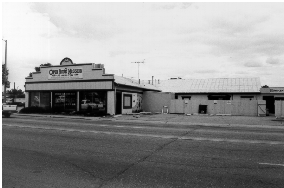
Figure 9. 316 Jefferson Street (5LR10298), view looking north.

sign board is affixed to the parapet, that announces the building's present use: "Open Door Mission..." "The Shelter" ... "Helping Others Learn to Help Themselves." Below the parapet is a band of painted wood paneling spanning the width of the façade and set between parallel belts of wood painted a contrasting dark color. The lower portion of the façade consists of a glazed storefront divided into three large bays filled with fixed display windows. Each display window is composed of two large panes of glass. The main entry to the building is located on its southeast side, close to the front, and consists of a modern, dark burnished metal frame glazed door, to the right of which is a large fixed 1-light window. Another, similar entry is located on the northwest elevation, facing Linden Street.