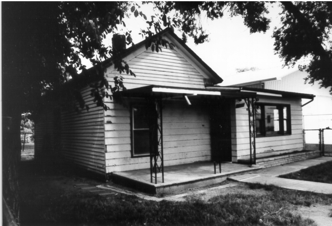
Figure 37. 308 Willow Street (5LR10321), looking east.

The enclosed rear porch spans the width of the house, and is covered by a shed roof. This porch is accessed via an entry near the northeast corner, with a low concrete pad in front. This rear entry is equipped with a solid wood door. Near the opposite end of this rear wall is a large 1/1 light, double-hung window. On the ground near this window is the concrete collar of a cellar stairwell. A door seals this subterranean opening.