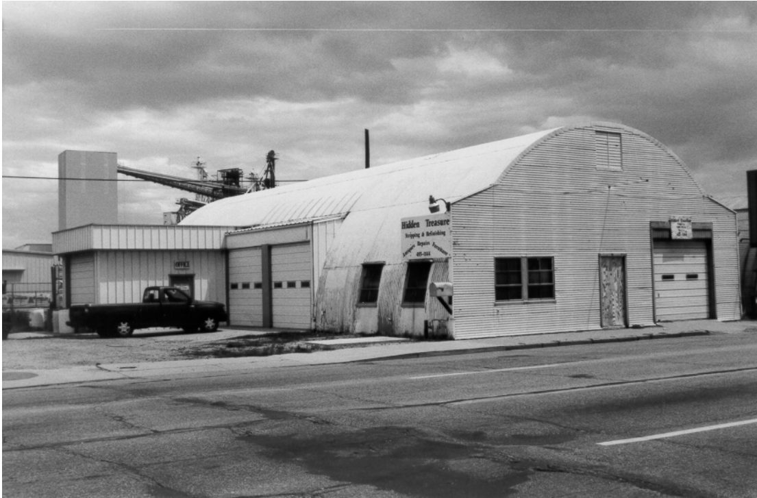
Figure 12. 400 Jefferson Street (5LR10301), looking east.

near the top of the façade has been sealed with sheet metal. Directly below this sealed window is a projecting metal (pipe) pole that had served in the past to hang a sign.