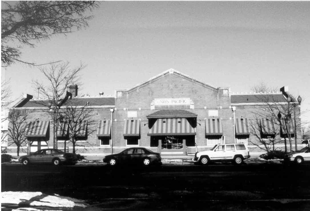
Figure 8. The Union Pacific passenger depot, 200 Jefferson Street (5LR462.12), view looking northeast.

brickwork flanking the vestibule, and very small square stone elements are placed at the upper corners of the parapet.