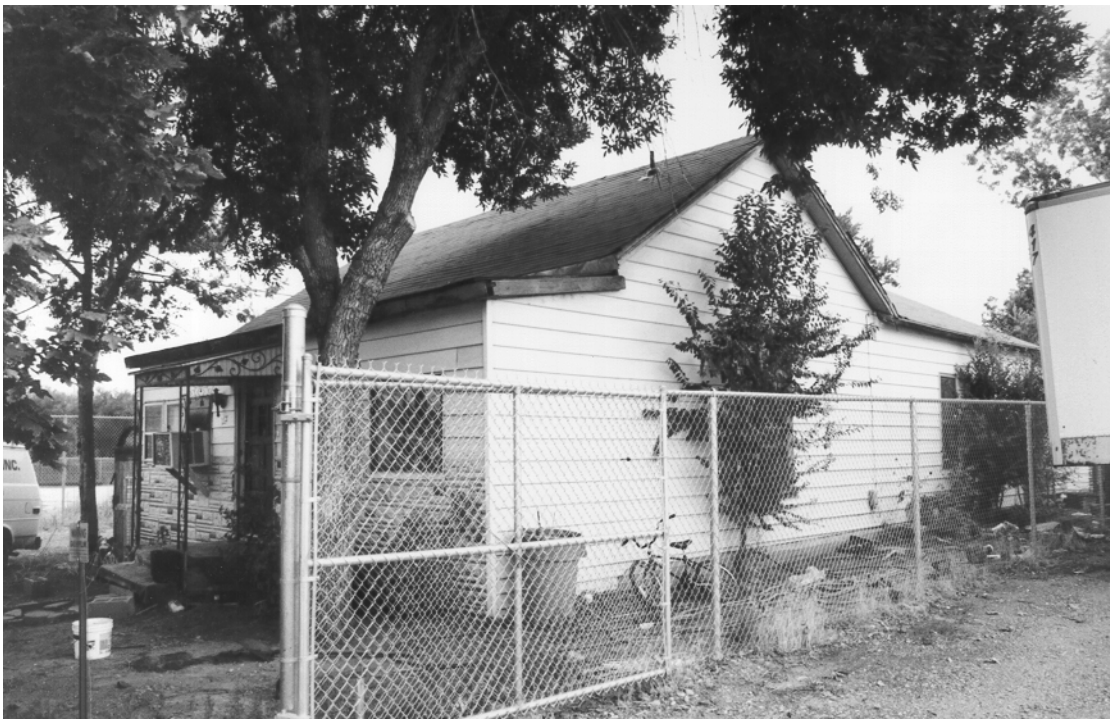
Figure 26. 414 Pine Street (5LR10311), looking east.

Description : This historical property consists of a single story, vernacular brick and wood frame dwelling located at the junction of Pine and Poudre Streets (Figure 26). The house is devoid of decorative ornamentation, and appears to be in fair condition. The small house rests on a concrete foundation, and its exterior walls are clad with wide, lapped vinyl siding. The rectangular-plan structure is covered by an asphalt shingle-clad, intersecting gable roof. The front portion of the house is covered by a relatively steeply pitched side gable roof, while the rear portion is covered by a relatively low-pitched, perpendicular gable roof. The roof eaves overhang slightly, and the soffits are boxed.