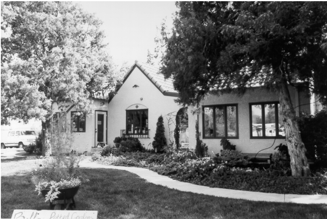
Figure 16. 1101 Lincoln Avenue (5LR10304), looking southeast.

The farmhouse, which has been adapted for commercial use, is a single story, stuccoed wood frame structure with Mediterranean stylistic details. The house has a rambling plan, and is covered by a complex, intersecting gable roof clad with red, semi-cylindrical ceramic roof tiles. Distinctive features include some arched window openings, steeply pitched gables with negligible eave overhang, and two massive, stuccoed exterior chimneys on the west elevation.