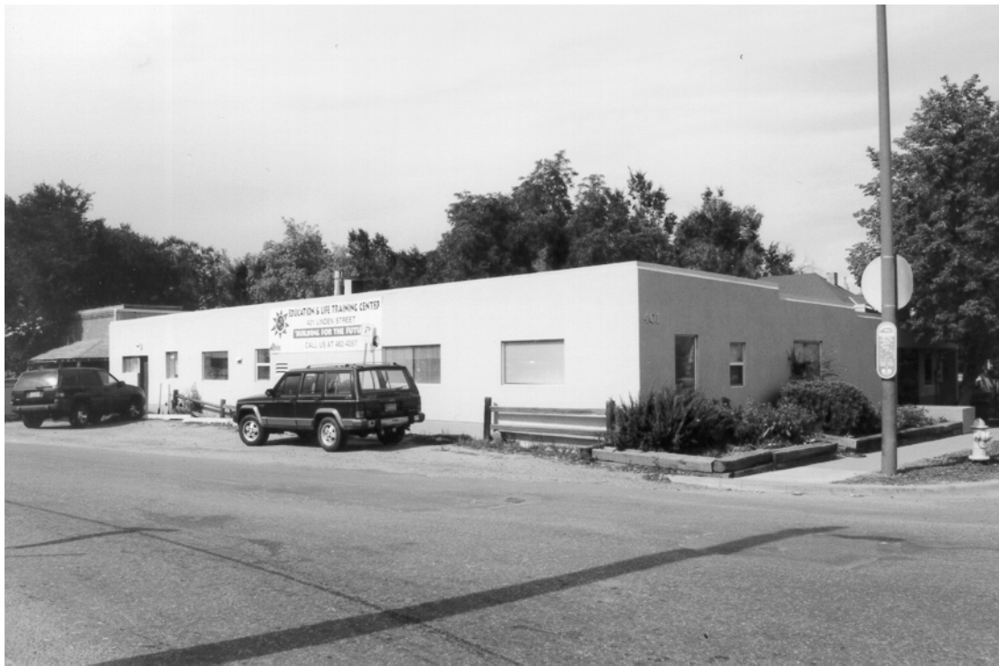
Figure 20. 401 Linden Street (5LR10307), looking north.

“poultry live or dressed, feed and remedies.” Ray’s Poultry was succeeded by Art’s Poultry, owned by Art Helmricks in 1951 or 1952, and by 1954 it housed Yager’s Poultry, owned by Clarence and Pearl Yager.