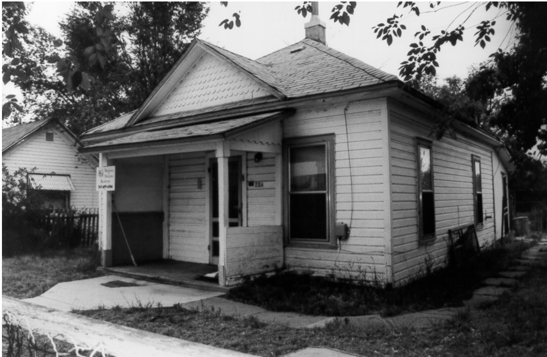
Figure 35. 224 Willow Street (5LR10319), looking north.

wood frame screen door. Additional windows are placed on the rear of the house as well as on the enclosed rear porch.