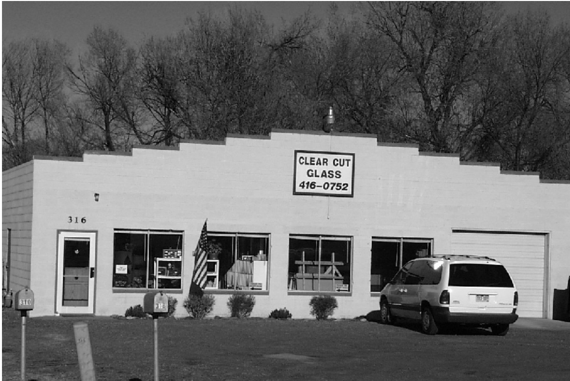
Figure 38. 316 Willow Street (5LR10352), looking east-northeast.

The building is situated within the boundary of the military post of Fort Collins (1864-1866). Prior to 1974 the property contained a small, working class dwelling.