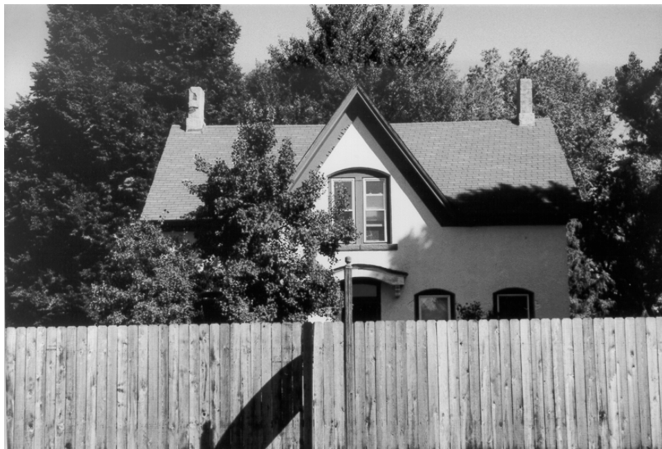
Figure 34. 232 E. Vine Street (5LR1572), looking north.

Description: This historic property, located on the north side of east Vine Street, consists of the farmhouse, stable (or barn) and landscaped grounds associated with the former Inverness horse farm. The farmhouse (Figure 34) is a 1½ story, cross-gabled dwelling with walls of stuccoed brick. The roof is steeply pitched, and features wide, open eaves. The main roof is side-gabled, with a smaller, steeply pitched gable centered on the façade. Near the east and west ends of the roof are identical, stuccoed brick chimneys. The house is surrounded by mature trees and a wooden fence is visible in the foreground.