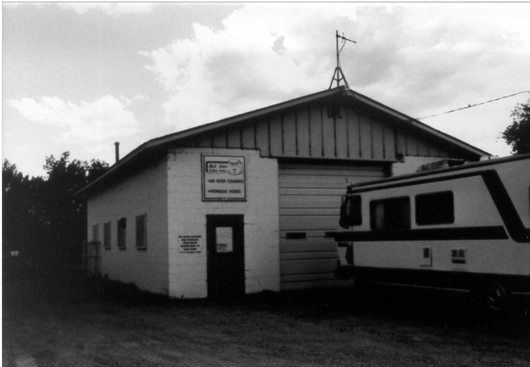
Figure 31. 203 E. Vine Street (5LR10316), looking south-southwest.

two roll-up garage doors on its east side. This rear wing is accessed via an unpaved driveway extending along the east side of the building.