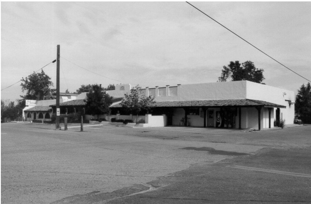
Figure 19. 400-404 Linden Street (5LR10306), looking east.

Description: This property consists of a large, rambling one story stuccoed concrete block commercial building with at least two major additions (Figure 19). The design of the building incorporates architectural elements reminiscent of the Mission Revival style. The main portion of the building has a very wide façade with a flat parapet, from which rises a taller flat parapet supporting a painted sign that reads: "Godinez Building ... Since 1960." To the right of this sign, the main flat parapet contains a series of recesses set between pilaster-like elements; these recesses contain panels of painted plywood. On the parapet to the left of the Godinez Building sign is a wide, modern sign that announces the name of the business contained inside: "EL BURRITO."