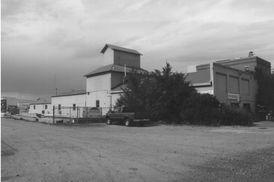
Figure 15. 119 Lincoln Avenue (5LR1900), looking north.

The roof of this section of the building is clad with corrugated sheet metal. The left or southwest elevation is stucco-covered, and is fenestrated with a variety of windows including a partially sealed arched opening containing a 3/1 light, fixed window; two modern 1/1 light, double-hung units; and a 16-light steel sash casement window near the front corner. Also on the southwest elevation near the front of the building is a sliding glass door that opens onto a relatively crudely built wooden deck.