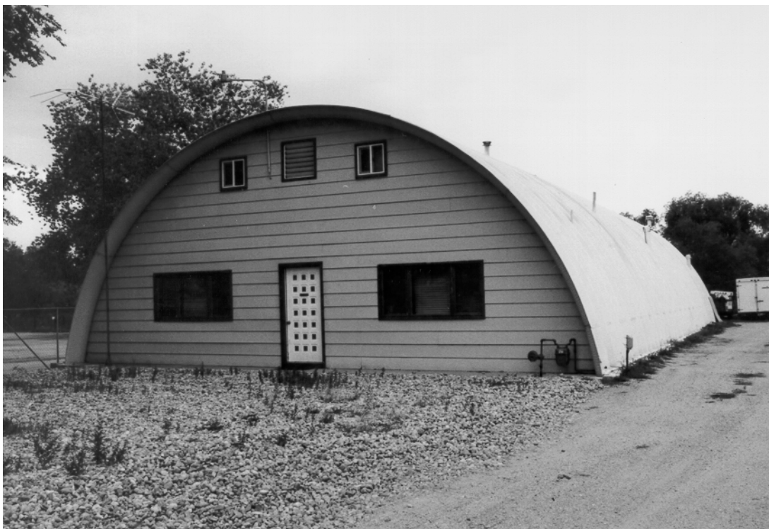
Figure 28. 103 E. Vine Street (5LR10314), looking south-southeast.

Description: Located on the south side of East Vine Street, this property consists of a prefabricated, Quonset-type building converted to residential use (Figure 28). The building rests on a poured concrete foundation, and is a semi-circular arched structure constructed of bolted-together sections of ribbed, heavy gauge sheet metal, painted white. Another prefabricated building of the same type is located at 416 Jefferson Street near Old Town Fort Collins.