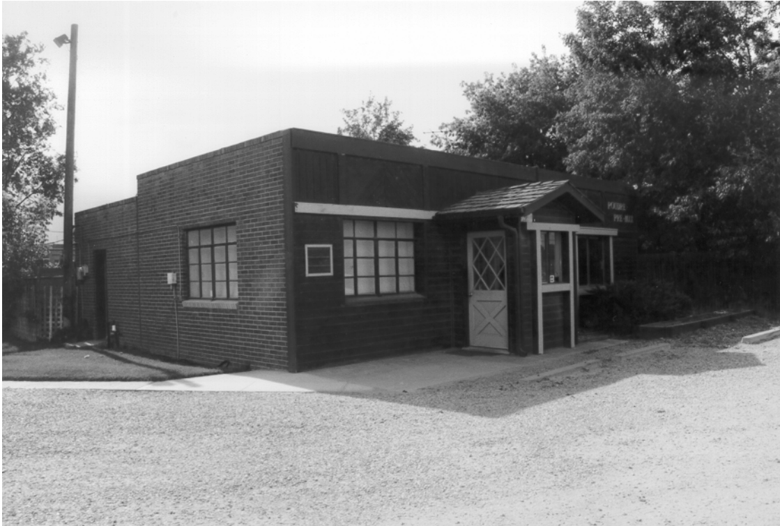
Figure 25. 418 Linden Street (5LR10310), looking northwest.

Historical Summary: This small brick building was evidently built in 1941 and served as the office for Columbine Floral Products, a small company co-owned by Paul E. Wood and Charles Warren, that sold wholesale artificial flower arrangements and wreaths. A long, concrete block-walled building situated near the office served as Columbine's manufacturing facility until 1971 (now owned by Ranch-Way Feeds). The small office building was sold to Ranch-Way Feeds, who later expanded it and leased it to Poudre Pre-Mix as an office for their concrete batch plant. Poudre Pre-Mix was started in 1959 by Glenn A. Chandler; in 1971 his son Tom assumed control of the company. In 2001, Poudre Pre-Mix was acquired by another concrete supplier, Aggregate Industries, who will likely continue to use the building as an office associated with the concrete plant.