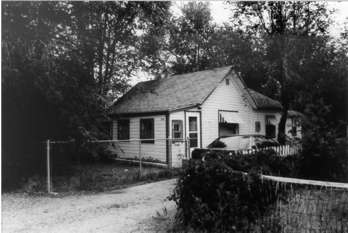
Figure 36. 226 Willow Street (5LR10320), looking north.