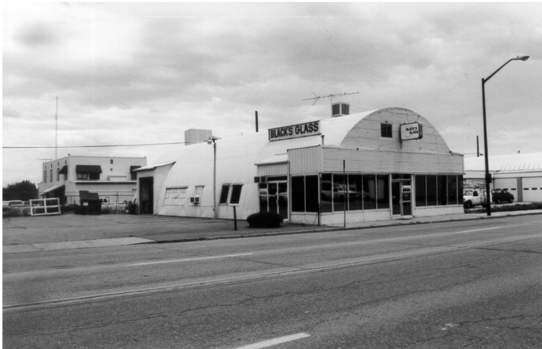
Figure 11. 360 Jefferson Street (5LR10300), looking east-southeast.