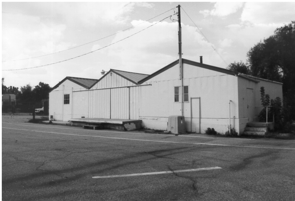
Figure 6. 430 N. College Avenue (5LR1495), storage building, looking northwest.

This utilitarian, rectangular plan outbuilding is located behind and northeast of the brick power plant building. The building consists of three, front-gabled, sheet metal clad sections, all resting on poured concrete foundations (Figure 6). All three sections have low-pitched roofs clad with ribbed, heavy gauge sheet metal, which do not overhang the walls. The outer (eastern and western) sections have walls clad with painted, smooth sheet metal panels, while the central section's walls are clad with ribbed sheet metal. Plain, painted metal personnel entries are located on the east and west ends of the building, and both are accessed via concrete stoops. Only two windows are installed on the storage building, and consist of 6-light fixed windows placed on the front (south side) of the outer sections.