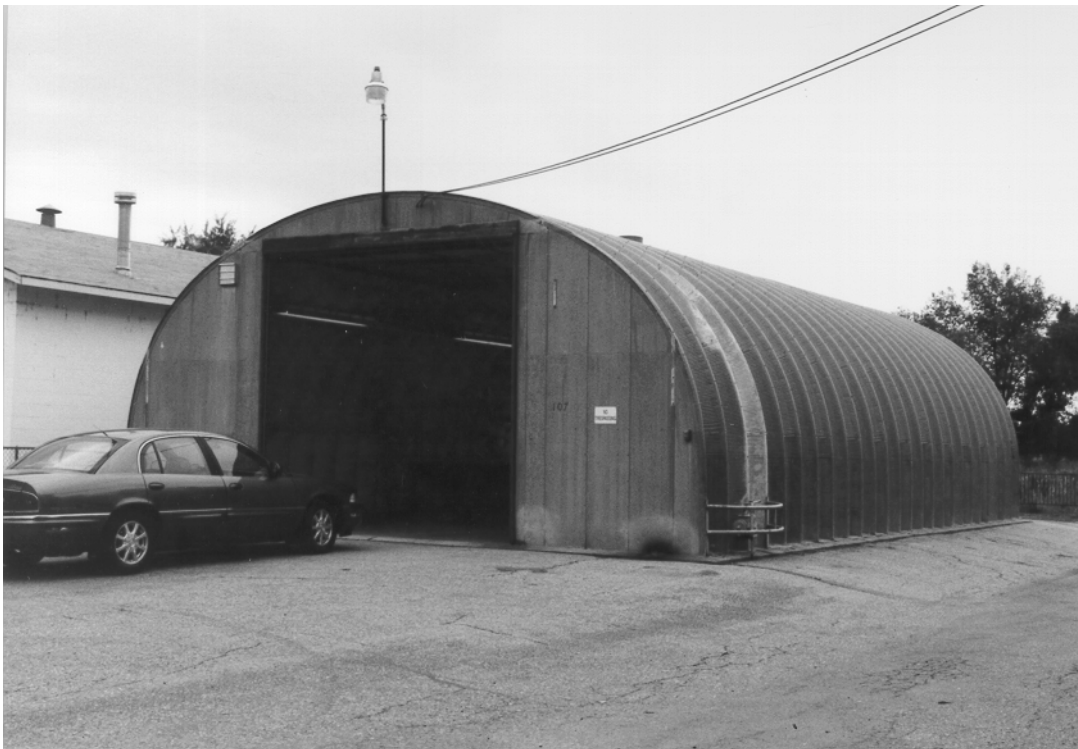
Figure 30. 105-107 E. Vine Street (5LR10315), Quonset-type hut, looking southeast.