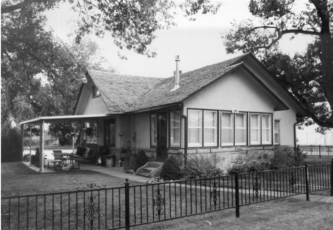
Figure 29. 105-107 E. Vine Street (5LR10315), dwelling, looking southwest.