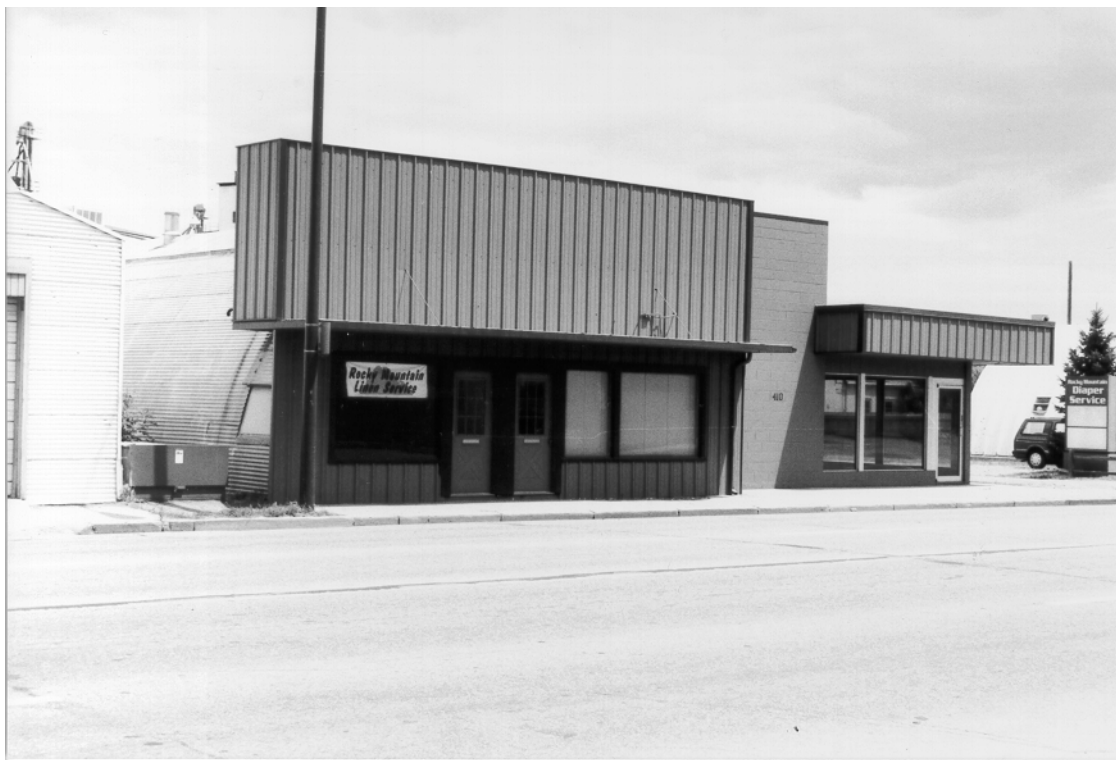
Figure 13. 410 Jefferson Street (5LR10302), looking east.

panel embellished with a relief “X” pattern. To the left of the main entries is a large fixed, 1-light display window, while to the right is a larger 2-light display window.