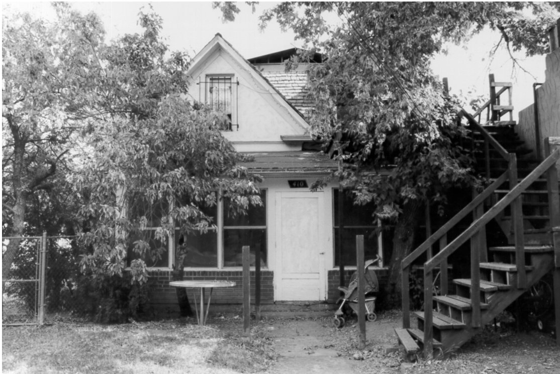
Figure 22. 408-410 Linden Street (5LR10308), looking southeast.

The right, or southwest elevation is partially obscured from view due its close proximity to the adjacent restaurant building (400-404 Linden/El Burrito Restaurant). Features observed on this elevation included a large gable with a stuccoed face surrounding a 1/1 light, double-hung window covered by a wrought-iron security grate. Towards the back of the house is a large, non-original, crude hipped dormer containing a ribbon of three 1x1 light, sliding sash or fixed windows. The dormer roof is clad with composition rolled roofing. The first floor is fenestrated with at least two windows placed between massive, buff-colored sandstone sills and lintels. Two red brick chimneys exit the peak of the roof, straddling the ridge line.