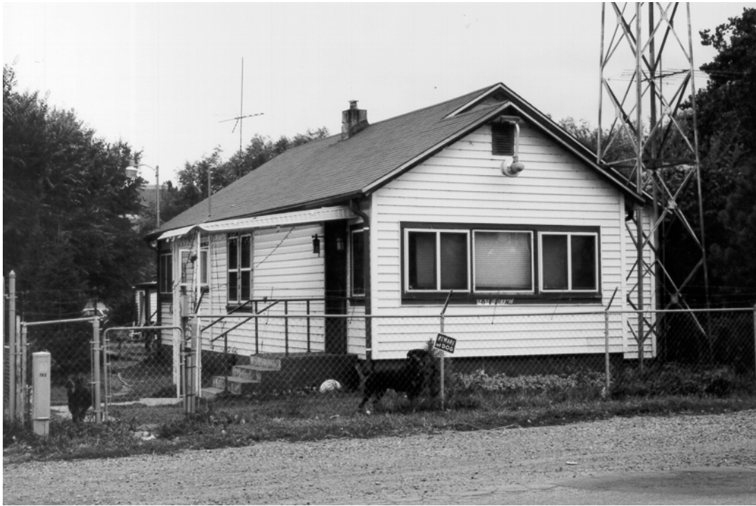
Figure 27. 101 E. Vine Street (5LR10313), looking southwest.

A gabled rear porch projects from the dwelling's south end, and contains an entry on its east side. A solitary plain brick chimney rises from the peak of the roof, near the center of the house.