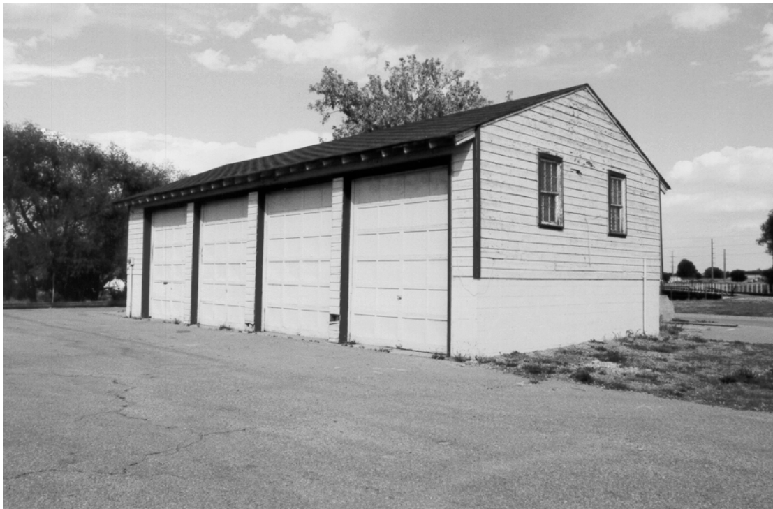
Figure 5. 430 N. College Avenue (5LR1495), Garage, looking northeast.

This four-bay, wood frame truck garage is located directly behind (east of) the power plant building (Figure 5). The garage is a single story, side-gabled structure resting on a concrete foundation. Its lower walls are constructed of painted concrete block masonry, while the upper walls are wood frame clad with horizontal drop siding. The roof is supported by a series of peeled log poles, including several placed between the garage bays that are boxed with drop siding. The building is covered by a moderately-pitched gable roof clad with asphalt shingles. The roof has wide overhanging eaves with exposed rafter tails on the long east and west elevations, while the rake ends exhibit negligible overhang.