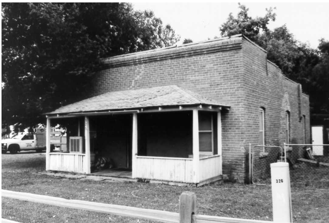
Figure 39. 326 Willow Street (5LR1562), looking north.

A wide, open front porch is affixed to the façade, and consists of a half-hipped roof (clad with asphalt shingles) supported by 4x4" wood posts. A closed rail of painted beadboard spans the posts, except for the central opening. The porch floor is made of boards and is not elevated.