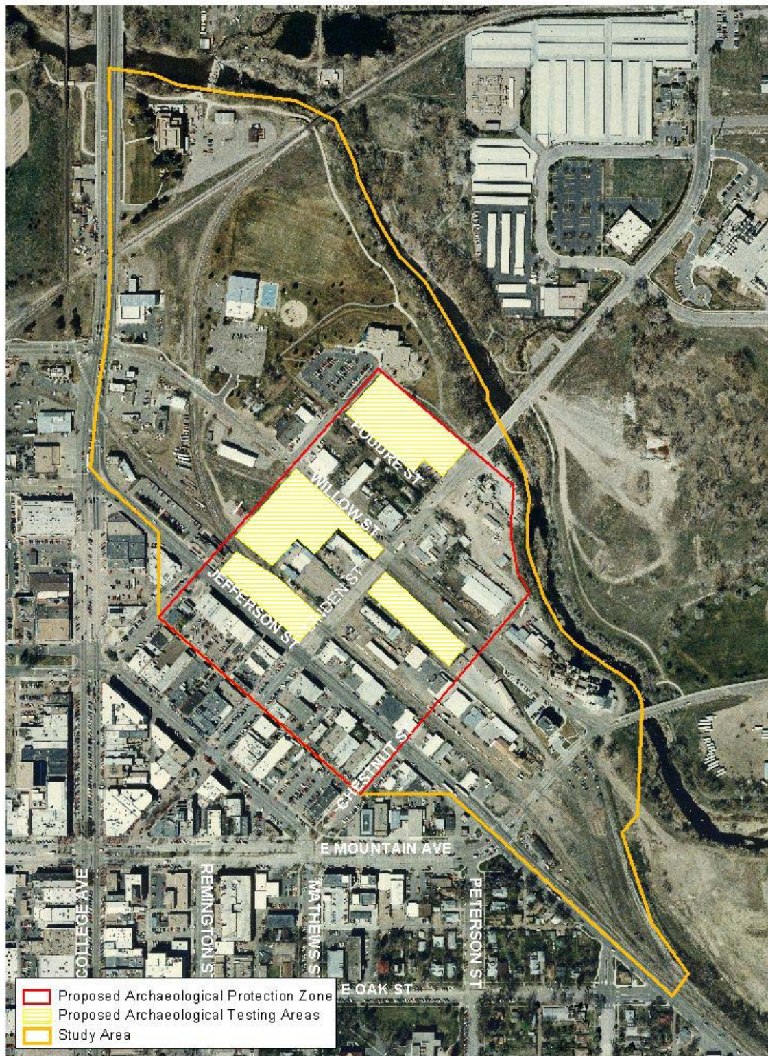
Figure 40. Proposed Archaeological Protection Zone and Ground Penetrating Radar Testing Locations.