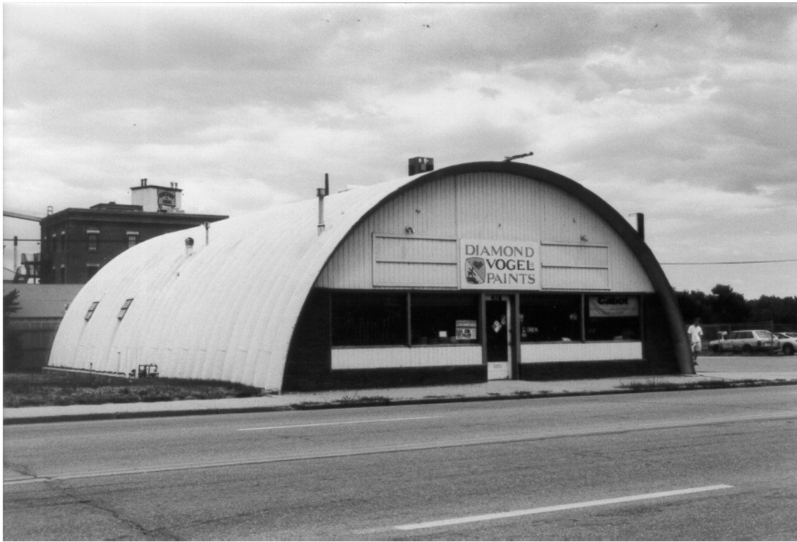
Figure 14. 416 Jefferson Street (5LR10303), looking east.

windows. Painted, vertically-grooved wood paneling is applied below the display windows and to the entire arched upper portion of the façade. A modern, flat painted signboard is affixed to the façade above the main entry, and declares “DIAMOND VOGEL PAINTS.” The base and ends of the façade are clad with thin red tile block masonry veneer.