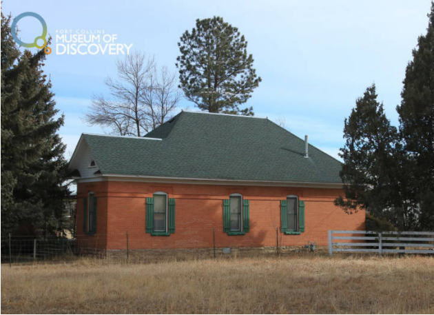
FIGURE 6. LOCALS ALSO GAVE SUFFRAGE SPEECHES AT THE SCHOOL HOUSE IN DISTRICT NO. 10/MOUNTAIN VIEW SCHOOL (C. 2010).

unknown, but it is not outside the realm of possibility. Leaders of the National Woman Suffrage Association strategically deployed well-connected men to lobby politicians in the 1910s. 53 The Fort Collins “suffragents” traveled to local schoolhouses throughout the fall to give their speeches. They spoke at the Fossil Creek School House, Leonard School House, and the schoolhouses in districts 10 (3039 West Vine Drive) and 101. 54