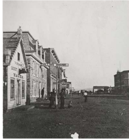
FIGURE 2. DOWNTOWN FORT COLLINS IN 1880.

While membership to the Fort Collins Equal Suffrage Association was originally small, it grew quickly. 8 The first local woman to host