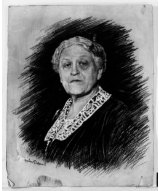
FIGURE 8. CARRIE CHAPMAN CATT (DATE UNKNOWN) WAS A NATIONAL LEADER OF THE WOMEN'S SUFFRAGE MOVEMENT.

When leaders of the Colorado movement found out that the question of women's suffrage would be on the ballot in 1893, they worried that the state was unprepared to wage a successful campaign. It seems they had a right to worry. The Non-Partisan Equal Suffrage Association of Colorado had less than twenty-five dollars in their treasury and fewer than one hundred official members across the state. 61 Suffrage leaders based out of Denver reached out to the National American Woman Suffrage Association (NAWSA) for help. National organizers, still smarting from Colorado's failure to pass the referendum of 1877, were initially skeptical that intervention was worth their time. 62 The rapid spread of outreach programs around the state changed their mind. Carrie Chapman Catt arrived in Colorado on Labor Day and started