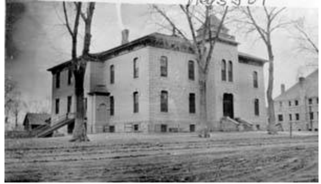
FIGURE 11. REMINGTON STREET SCHOOL (DATE UNKNOWN) WAS ONE OF THE POLLING PLACES WHERE FORT COLLINS WOMEN VOTED FOR THE FIRST TIME IN 1894.

Fort Collins women did not disappoint on their first election day. A total of 439 women showed up to vote in the city elections, making up 46% of the total voters that day. 80 They cast their ballots in four different locations around the city. Three of the polling stations were located on College Avenue—the Commercial Hotel at 166-180 North College (better known now as the Northern Hotel), the Opera House, and the “Office, formerly occupied by C. Golding-Dwyre, College ave.” 81 The fourth polling station was located in the