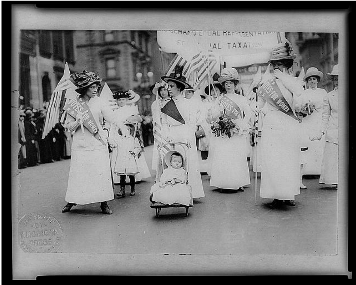
FIGURE 16. SUFFRAGETTE PARADE IN NEW YORK CITY IN 1912.

to gain national suffrage by winning over one state at a time, a slower and more practical approach than trying to push for an amendment to the U.S. Constitution. However, as the number of suffrage states grew in the 1910s, an amendment suddenly seemed far more achievable. 152 When President Wilson finally supported an amendment in 1918 as a gesture of thanks for American women's contributions during World War I, national women's suffrage seemed on the cusp of