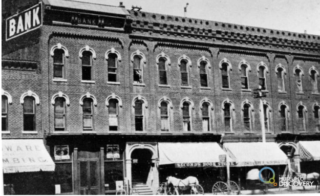
FIGURE 9. OPERA HOUSE (C. 1903) WHERE CATT SPOKE IN OCTOBER 1893.