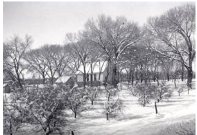
FIGURE 5. FORT COLLINS MEN GAVE A SPEECH IN FAVOR OF WOMEN'S SUFFRAGE AT FOSSIL CREEK SCHOOL HOUSE IN 1893 (C. 1930). PHOTO COURTESY OF THE FORT COLLINS MUSEUM OF DISCOVERY, ID: H05693.

As a result, when locals formed a new Equal Suffrage Association in September, men were welcomed as members. 51 That same month, the local newspaper printed the names of seventeen men giving speeches around Larimer County in favor of women's suffrage. 52 Whether or not Fort Collins women arranged for these men to campaign on their behalf is