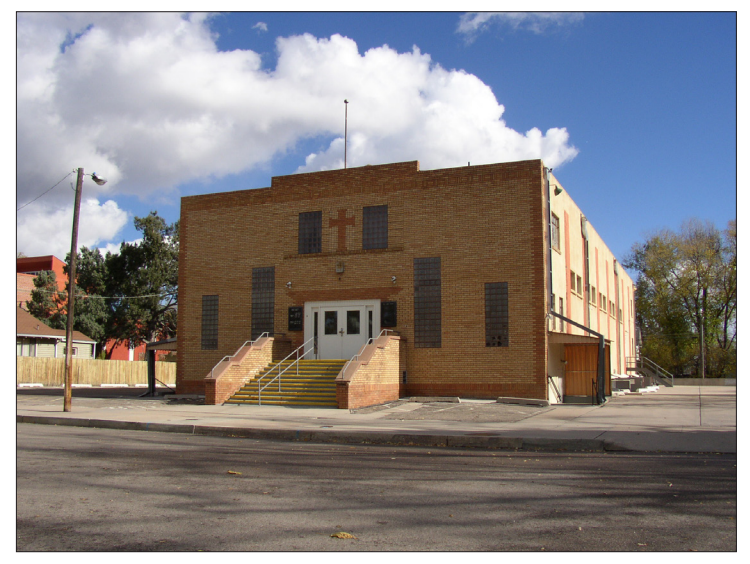
Figure 2. Holy Family parish hall, 324 N. Whitcomb Street

In 1971, the PSD launched a pilot bilingual program in the Dunn, Harris, LaPorte Avenue, and Washington elementary schools.<sup>27</sup> In 1975, a bilingual class was held at Laurel Elementary School, supported by federal migrant education funding. Although 15 children were enrolled in the bilingual class at Laurel in 1975, it was scheduled to be discontinued for the following year. Federal funding for the Laurel class also provided for health and social services; the school district planned to provide those services at other neighborhood schools in 1976.<sup>28</sup>