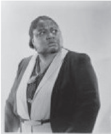
Hattie McDaniel, a nationally-acclaimed radio and film star during the early-1900s. Her family lived in a home on Cherry Street for several years when she was a child before moving to Denver.

Fort Collins is full of rich history just waiting to be explored. Put on your best walking shoes or grab your bike, scooter, or skateboard and check out the places that have made Fort Collins what it is today. Be mindful that some of these locations are private residences – enjoy from the street but please respect private property.