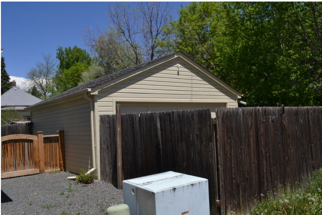
809 W. Mountain Ave., Garage, south and west elevations