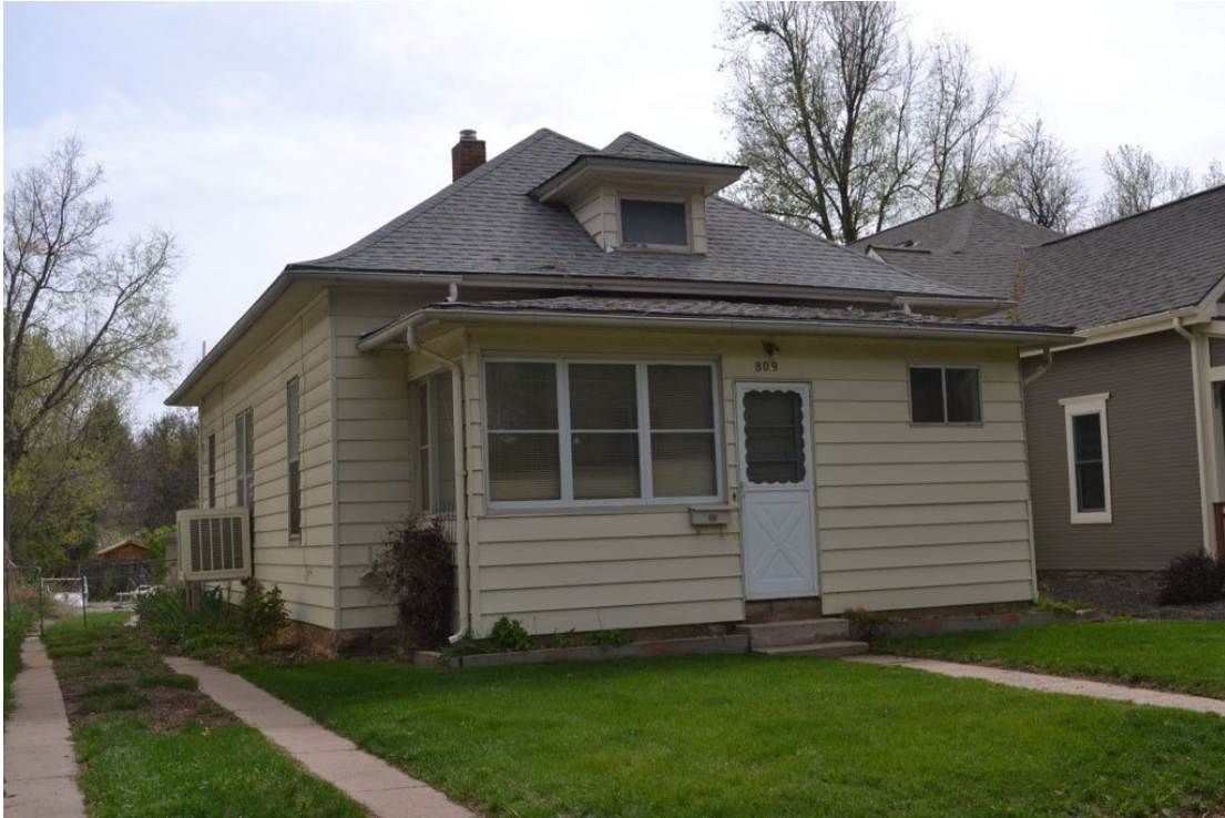
809 W. Mountain Ave., north façade and east elevation (Mary Humstone, May 2016)