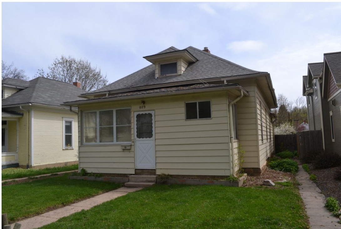
809 W. Mountain Ave., north façade and west elevation (Mary Humstone, May 2016)