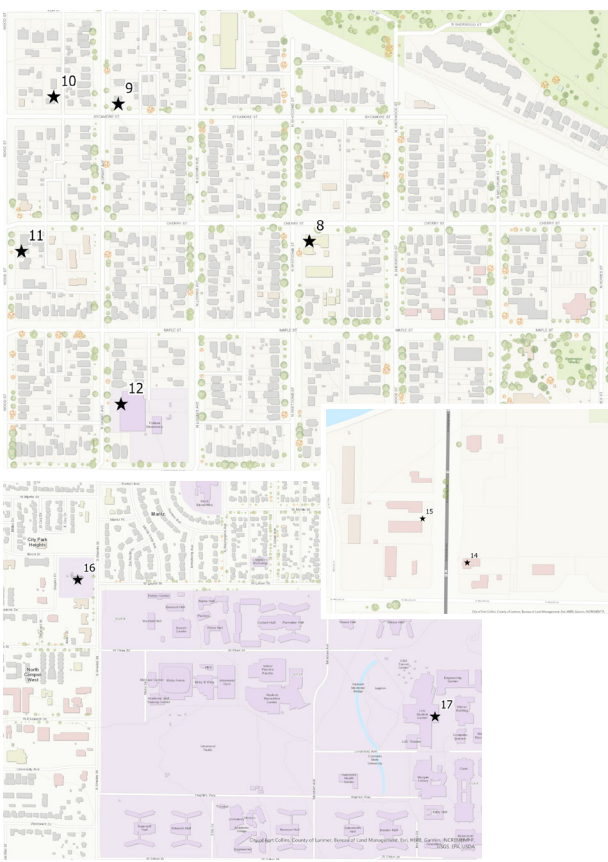
You're welcome to explore these sites in our suggested order for a pleasant walking/biking loop or any order you wish. Please take care to walk and hike safety.