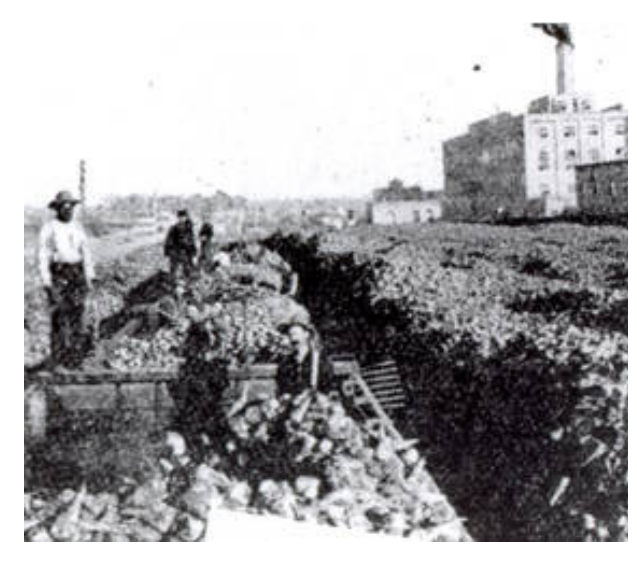
Hispanic sugar beet workers with the Great Western Sugar Factory in the background. (HO3125, Courtesy of the Fort Collins Museum of Discovery)