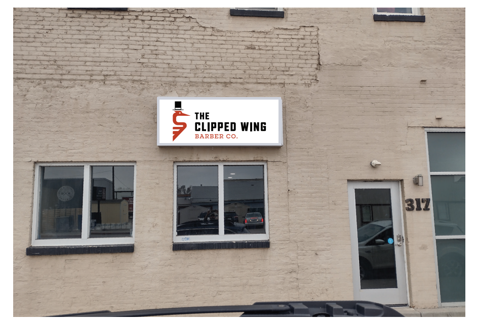
Represents approximate view of finished product.