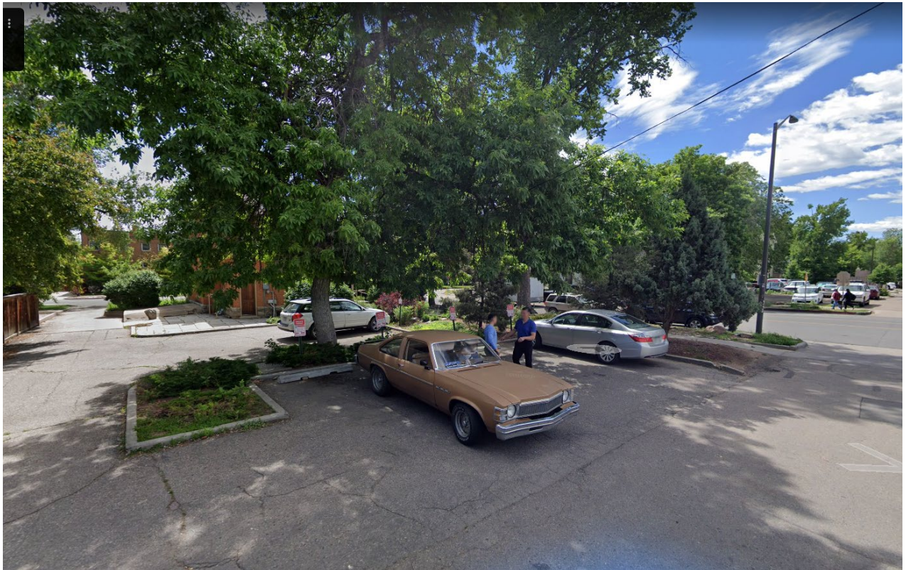
Alley, looking north