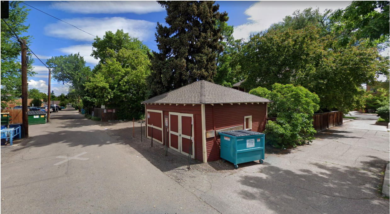
Alley, looking north