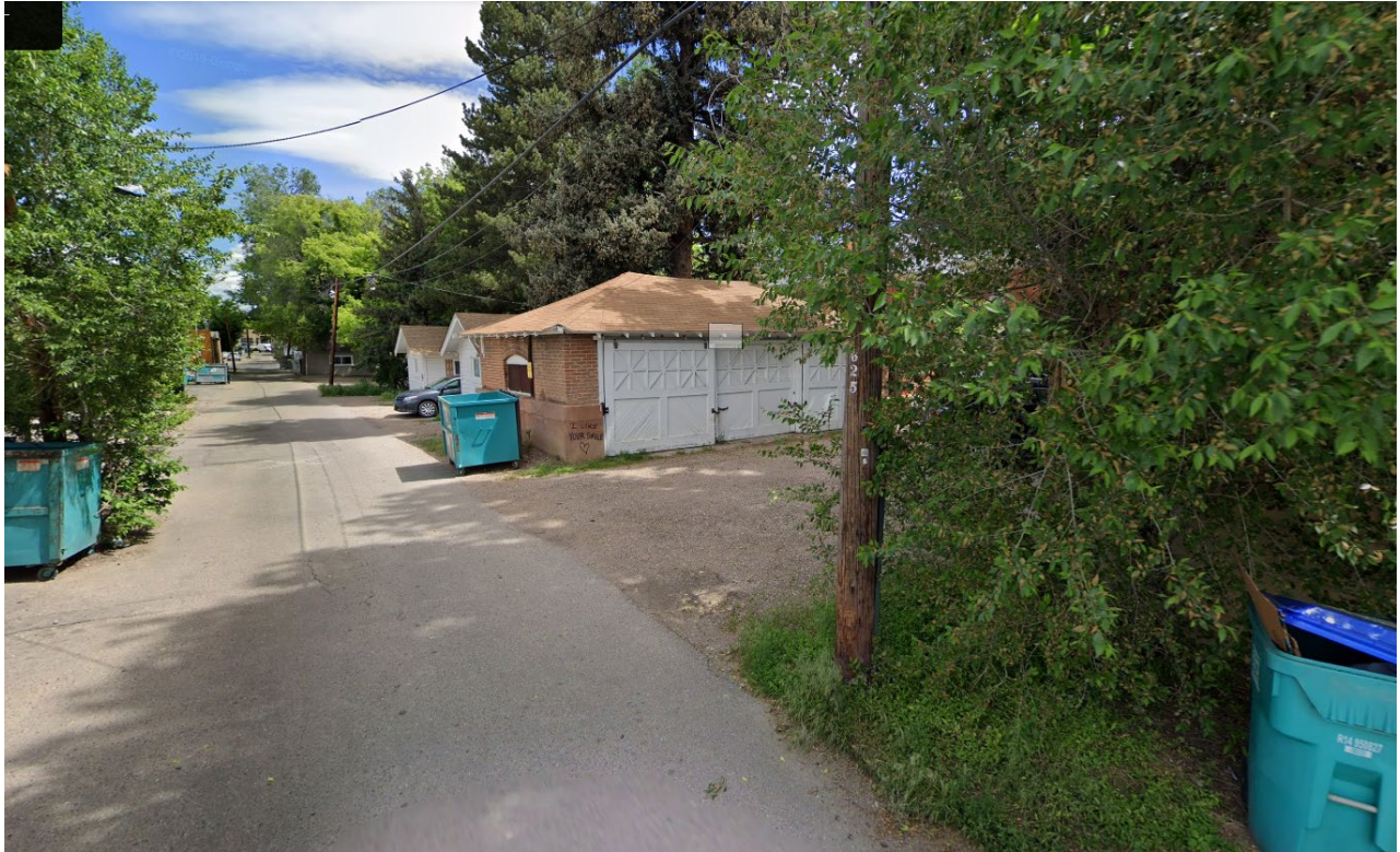
Alley, looking north