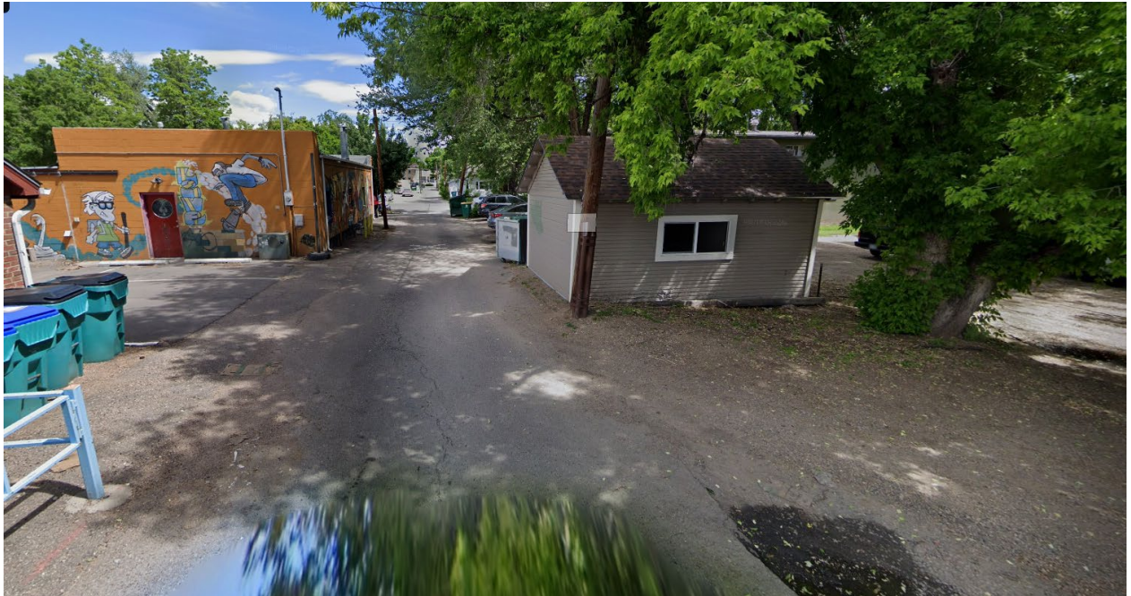
Alley, looking north