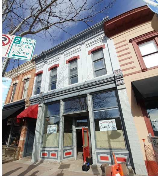
Existing Paint Colors

255 Linden Street. Fort Collins CO, 80521