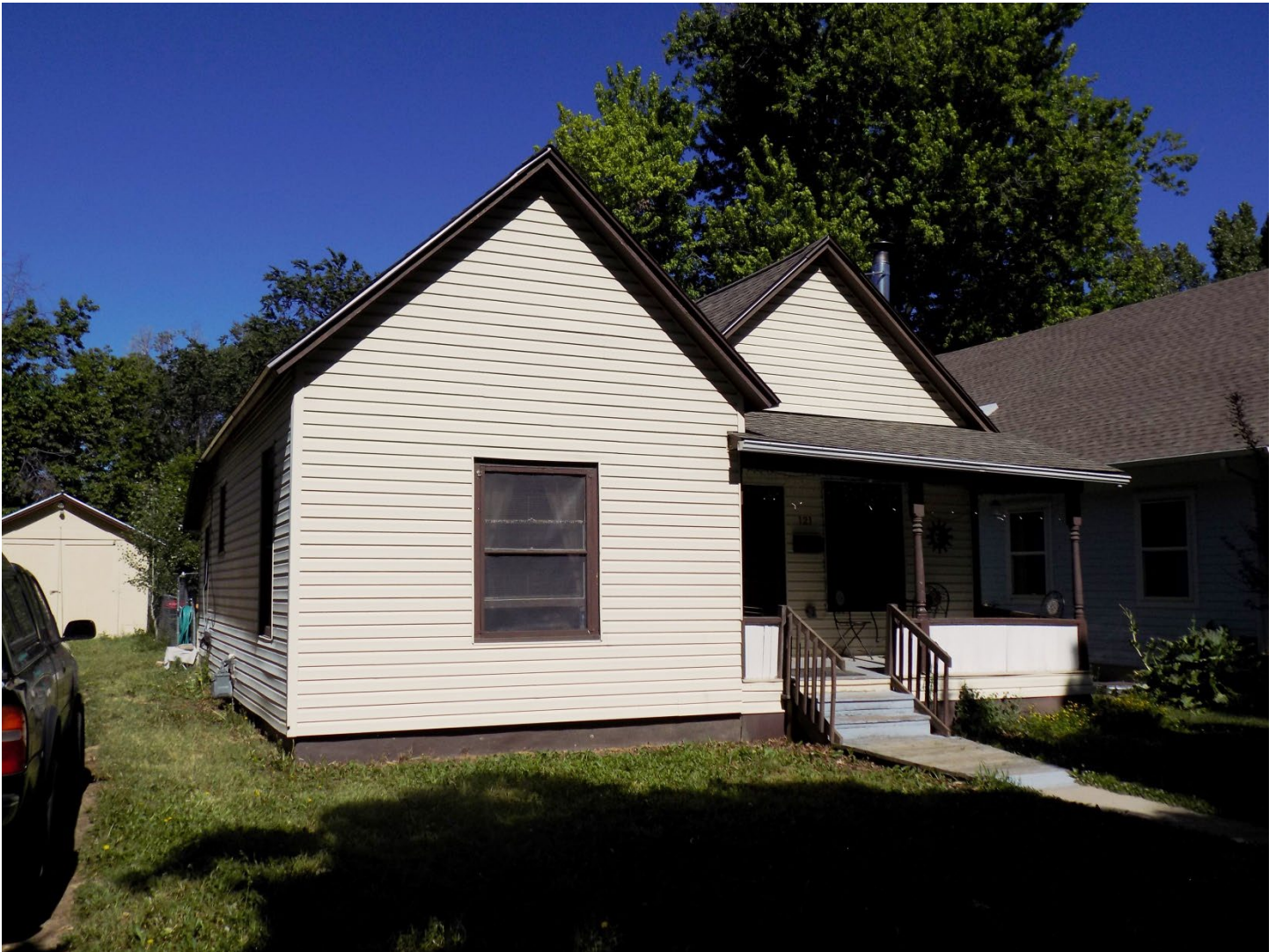
121 N Whitcomb St., south side and east façade (Luke Anderson, June 2016)