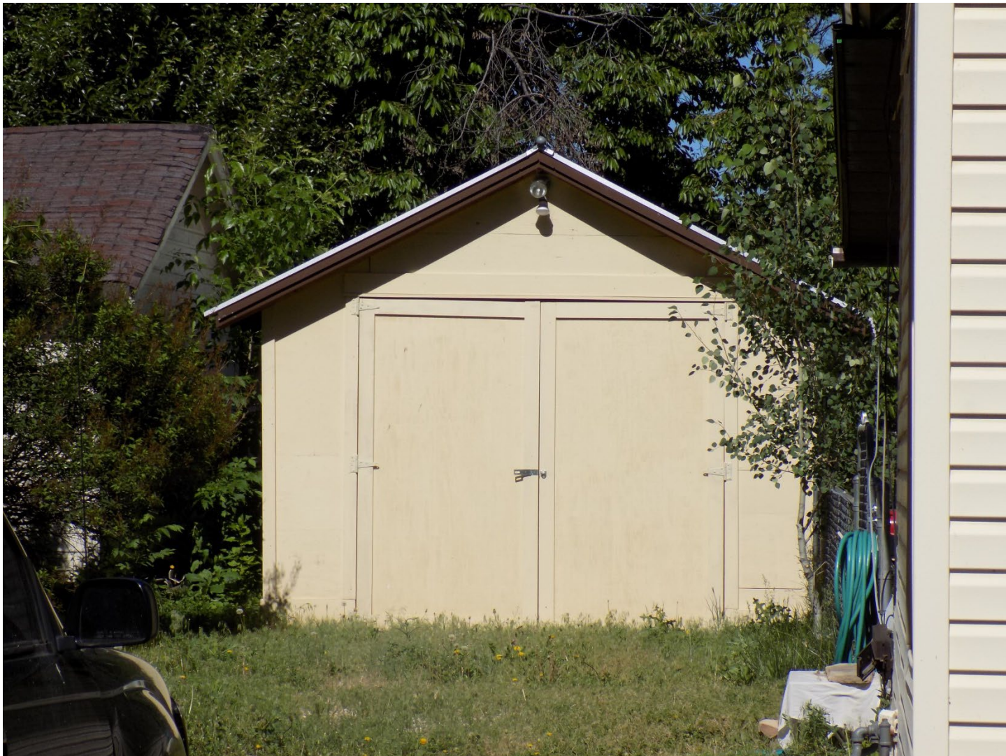
121 N Whitcomb St, Garage, east side (Luke Anderson, June 2016)