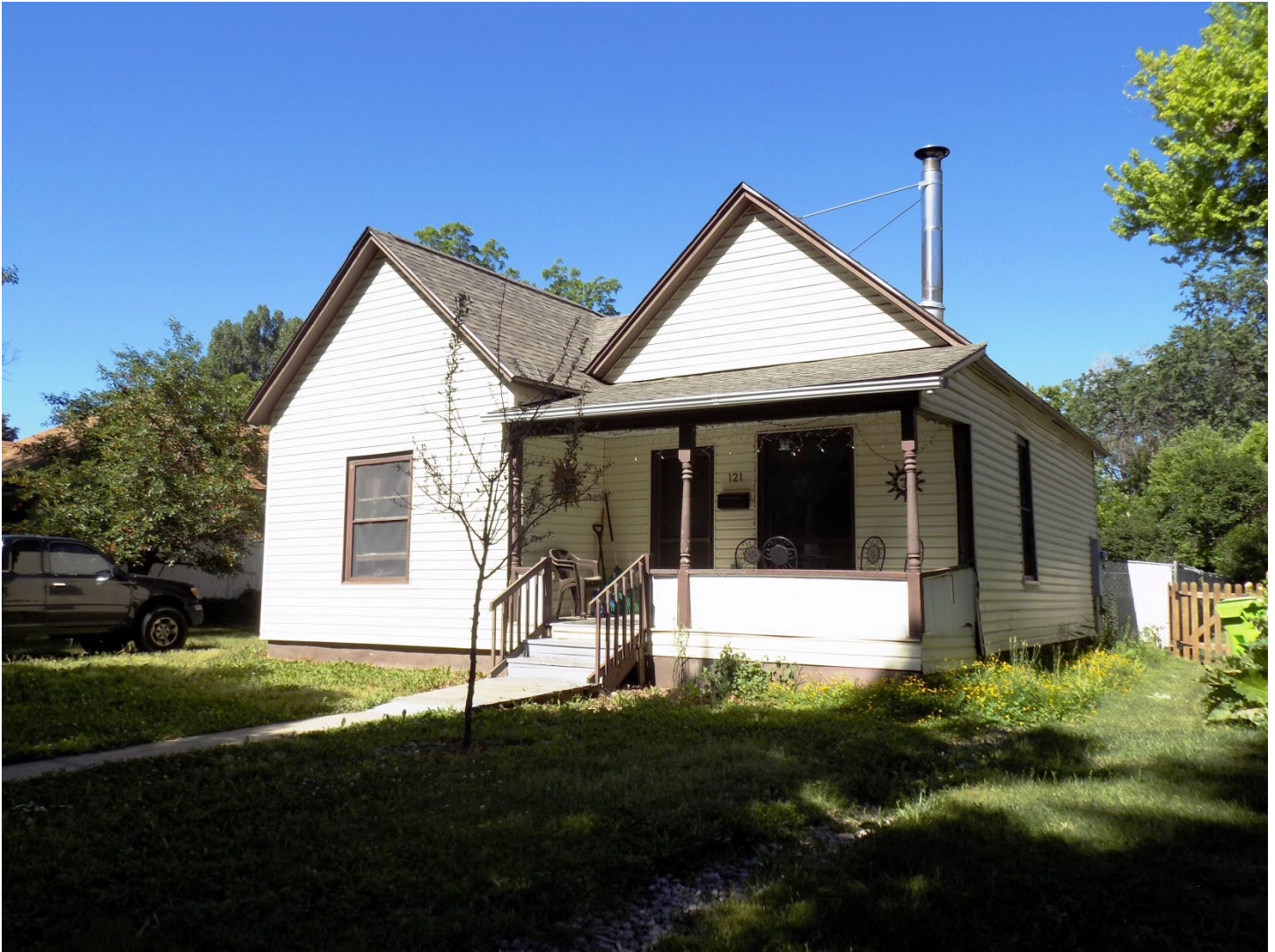
121 N Whitcomb St., east façade and north side (Luke Anderson, June 2016)