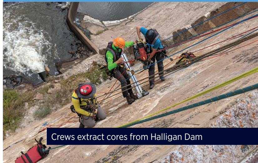
Crews extract cores from Halligan Dam