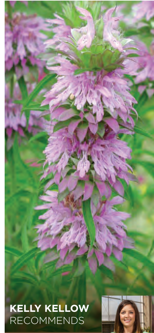
KELLY KELLOW RECOMMENDS