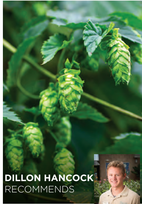
DILLON HANCOCK RECOMMENDS