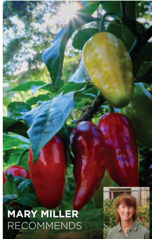
MARY MILLER RECOMMENDS

Lemon beebalm grows up to two feet tall and is a great addition to any herb or scented garden. It is an easy to grow native wildflower that tolerates drought heat and full sun. The blooms color last all summer long and into the fall when everything else has faded. This plant will re-seed where it is happy and can be enjoyed year after year.