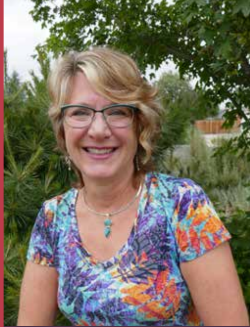
THE MOON GARDEN ANNE CLARK Anne Clark Design

The plants that I have selected for the garden may have fragrant flowers or foliage, and their scent may be stronger in the morning, during the heat of the day, or in the evening. Some of the plants may require you to get very close to detect the scent, while others may be picked up as you enter. Remember, that we each experience scent differently. I invite you to experience this garden at different times of the day, at different times of the year. Your senses will thank you for the journey!