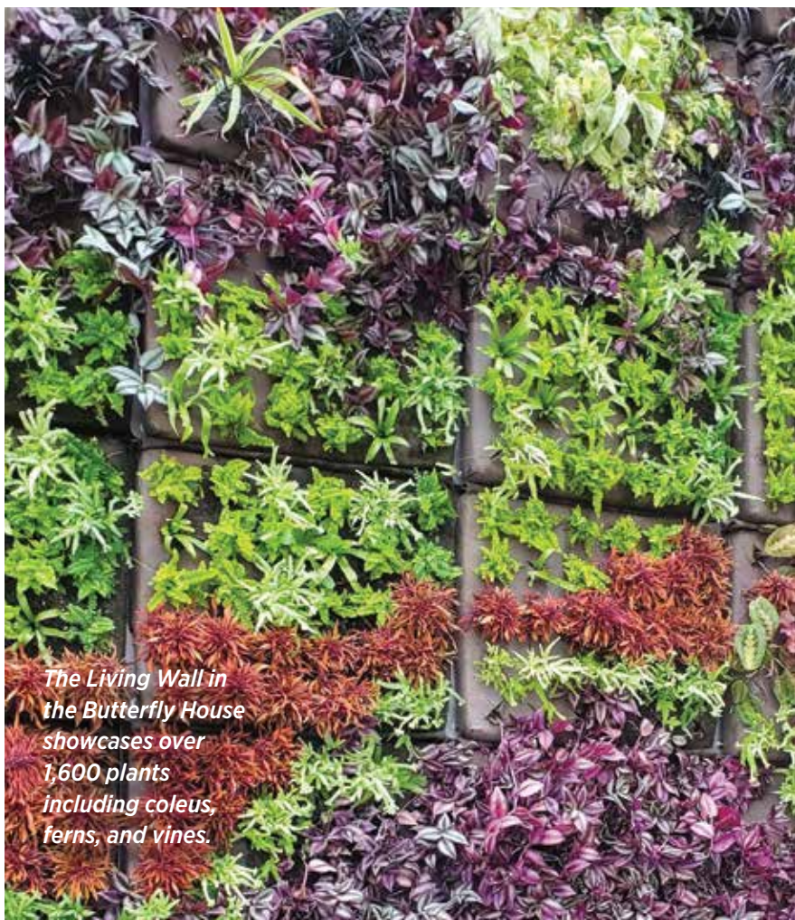
The Living Wall in the Butterfly House showcases over 1,600 plants including coleus, ferns, and vines.