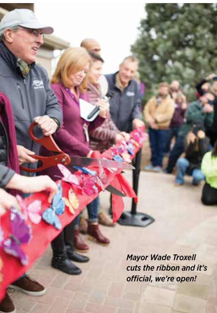
Mayor Wade Troxell cuts the ribbon and it's official, we're open!