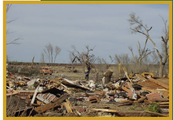
Figure 3: Damage after a tornado.