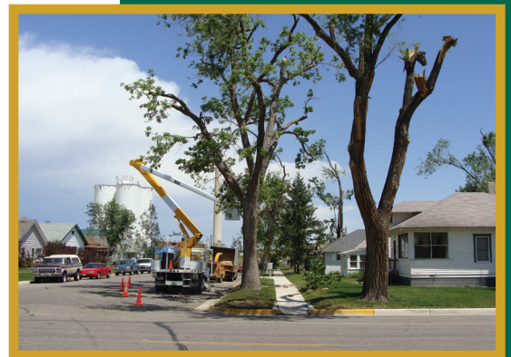
Figure 4: A company pruning storm-damaged trees.