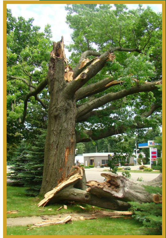
Figure 8: A tree that has lost the leading stem (the main upward-trending branch).

Some trees simply can't be saved or are not worth saving. If the tree has