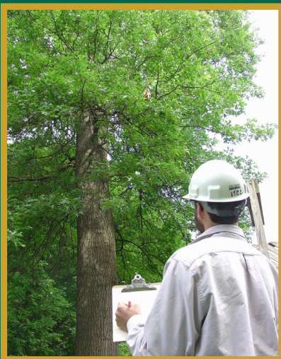
Figure 7: A careful assessment of trees is important before and after a storm.

If a tree has been weakened by disease, there may be little that can be done to prevent major breakage or loss when the stresses of a storm occur. However, there are preventive measures you can take to help strengthen your trees so they are more resistant to storm damage.