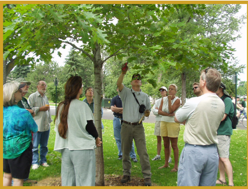
Figure 12: A CSFS forester demonstrates proper pruning techniques at a workshop.

For more information on urban and community forestry, please visit the Colorado State Forest Service website at www.csfs.colostate.edu or contact your local forester.