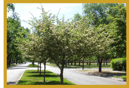
Figure 2: Hawthorn tree ( Crataegus spp).

“If a tree is large and the work is off the ground, or if a chainsaw is needed, it’s best to contact a qualified arborist,” Rosenow adds. “They have the equipment and know how to safely remove broken or downed limbs and to help save and repair trees.” If you need professional help, locate a qualified tree care specialist and check their references.