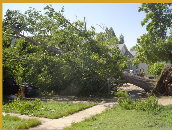
Figure 1: Fallen tree due to wind.

“Trees are amazingly resilient and many recover with proper care and time,” said John Rosenow, president of The Arbor Day Foundation.