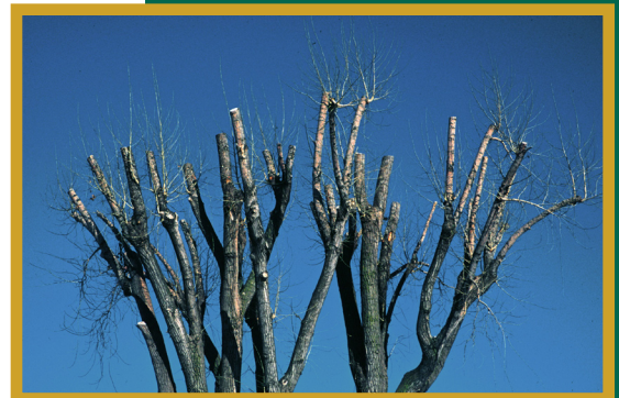
Figure 5: Avoid topping your trees.