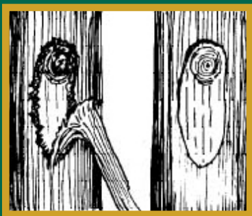
Figure 10: Clean up torn bark. This will heal the tree faster.