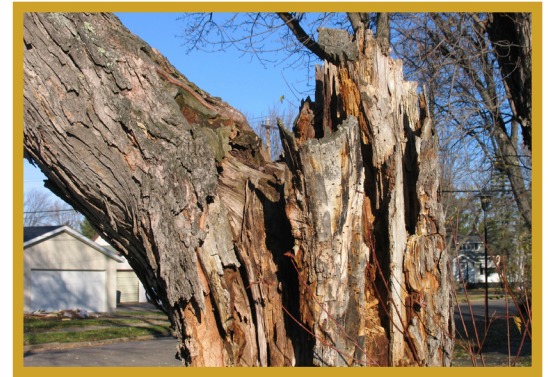
Figure 6: Decay inside this tree made it hazardous before the storm occurred.