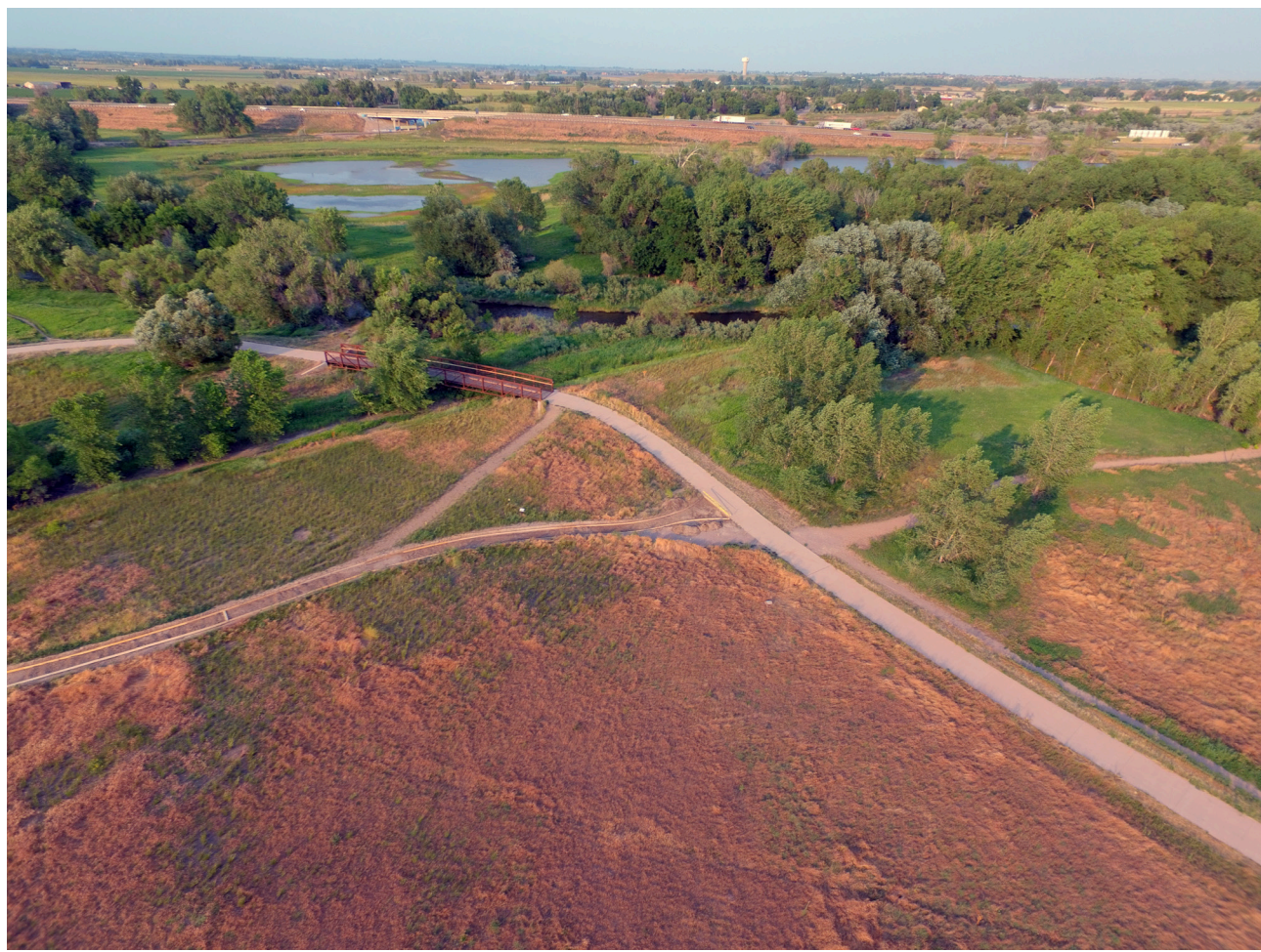
Poudre Trail at I-25