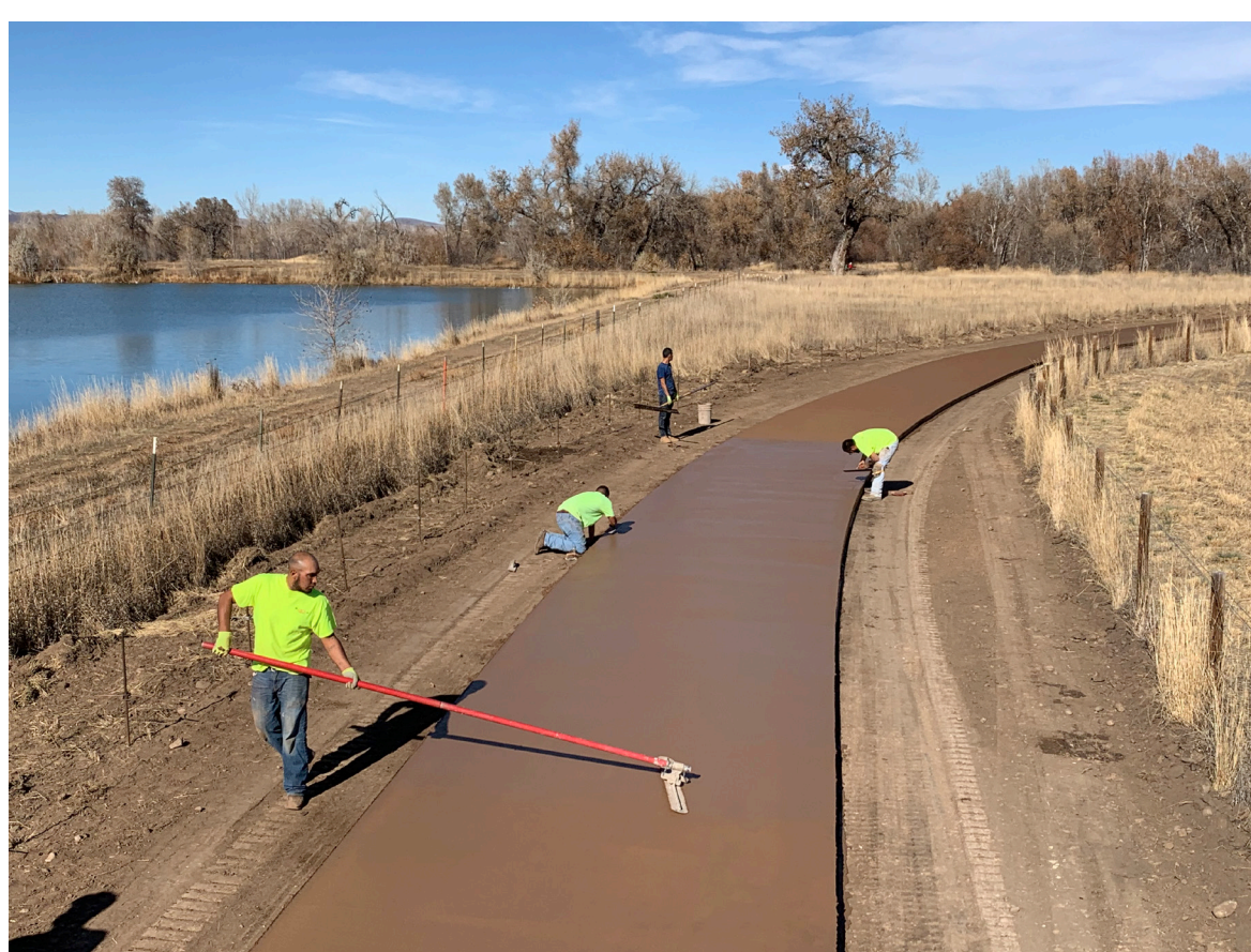
Poudre Trail Spur being installed