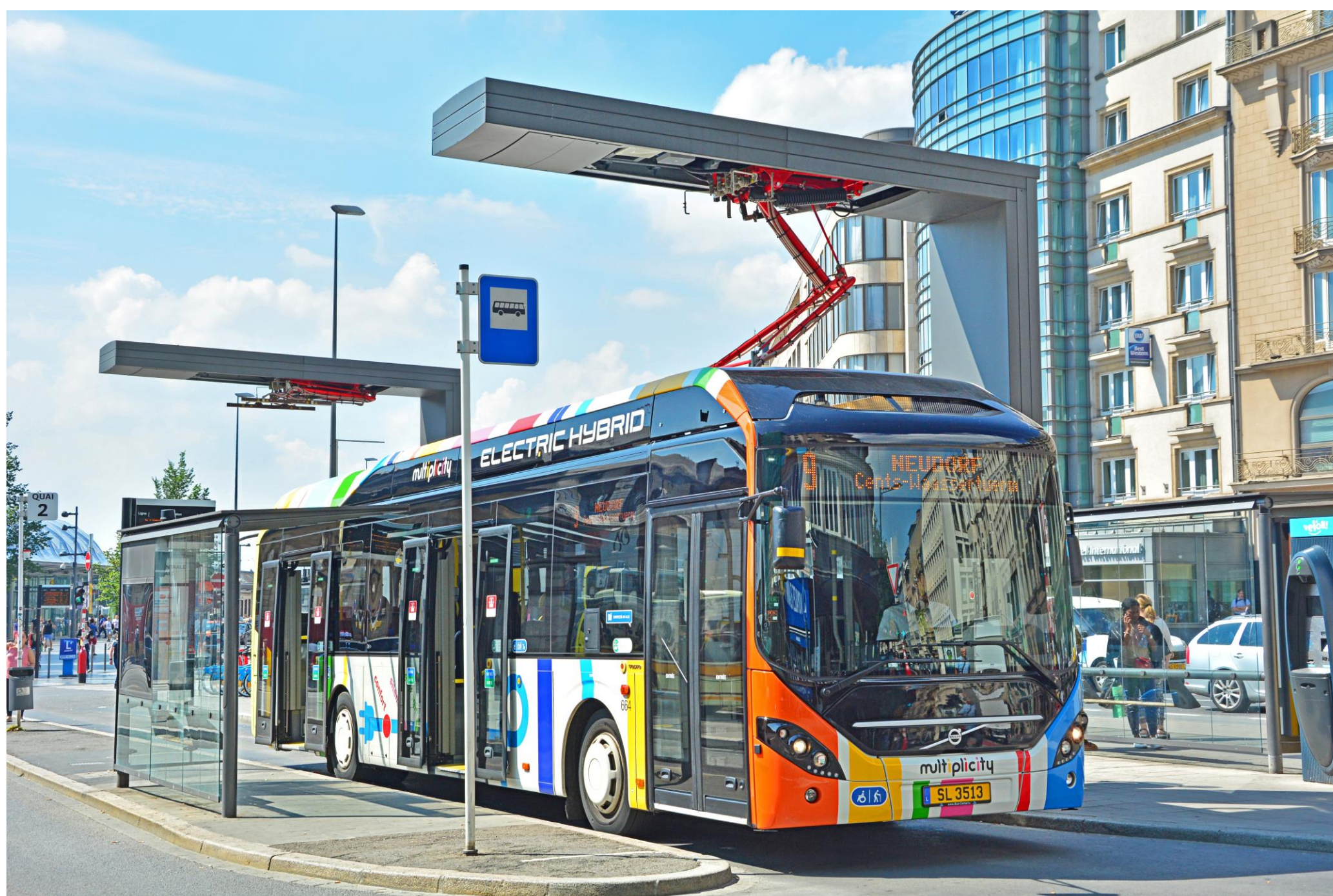
Examples of on-route charging