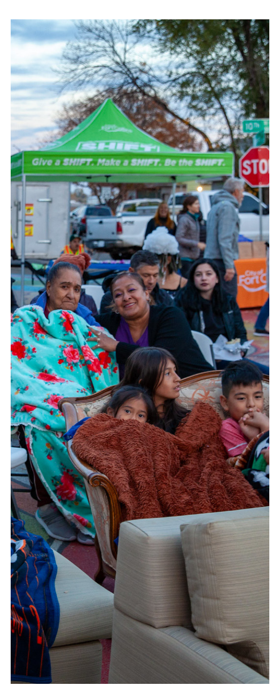
Participants waiting for the Dia de los Muertos Bike-In Movie Night showing.