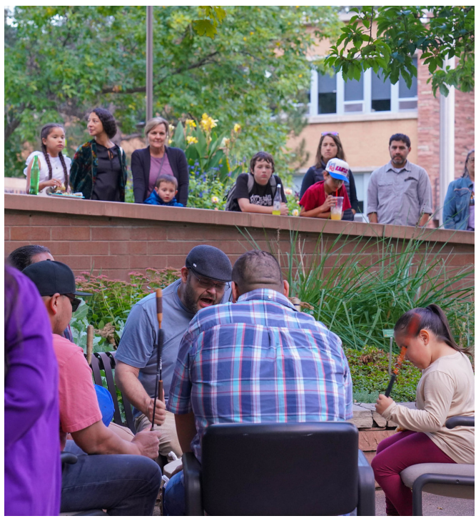
Group playing instruments while crowd looks on. Indigenous Peoples Day Proclamation 2022 City Hall, Fort Collins, CO.