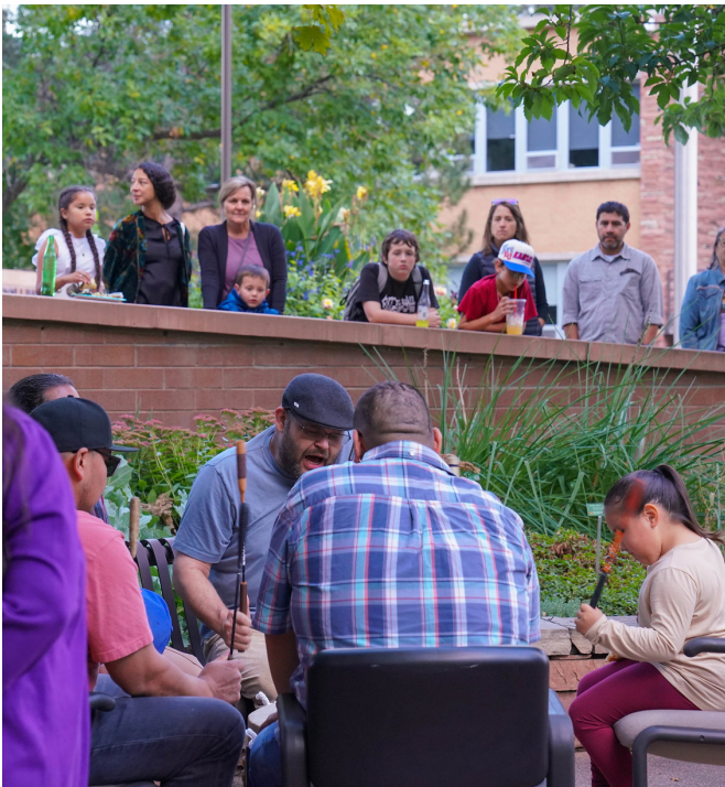
Group playing instruments while crowd looks on. Indigenous Peoples Day Proclamation 2022 City Hall, Fort Collins, CO.