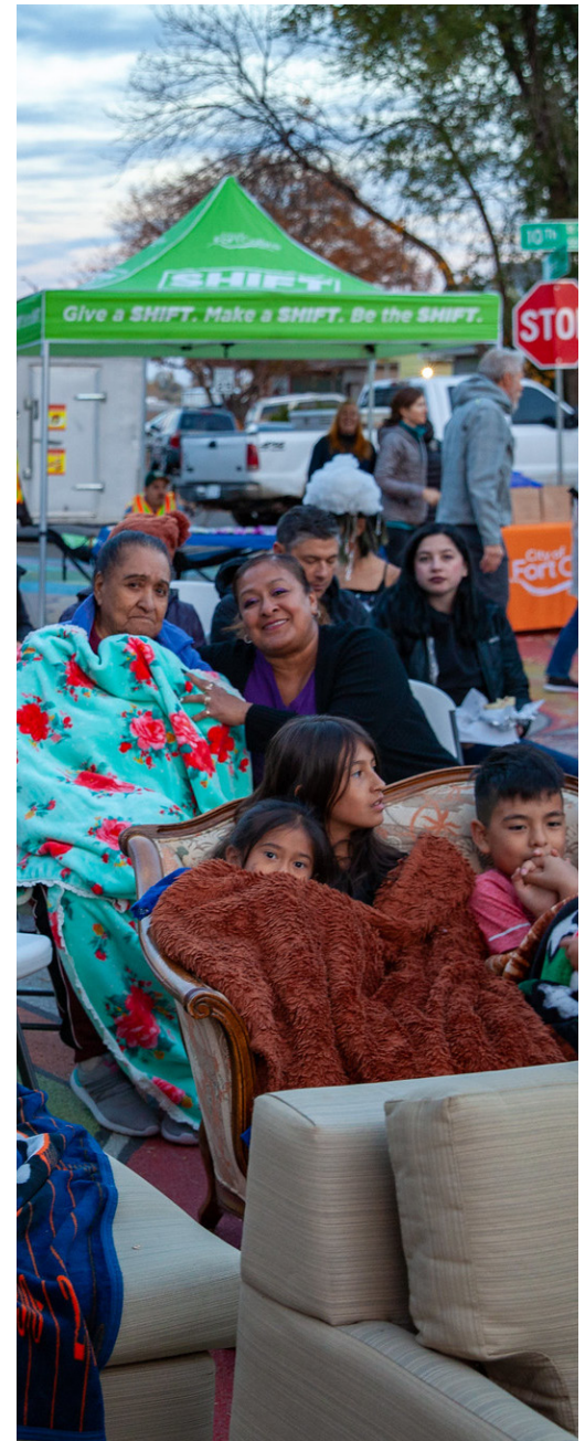
Participants waiting for the Dia de los Muertos Bike-In Movie Night showing.