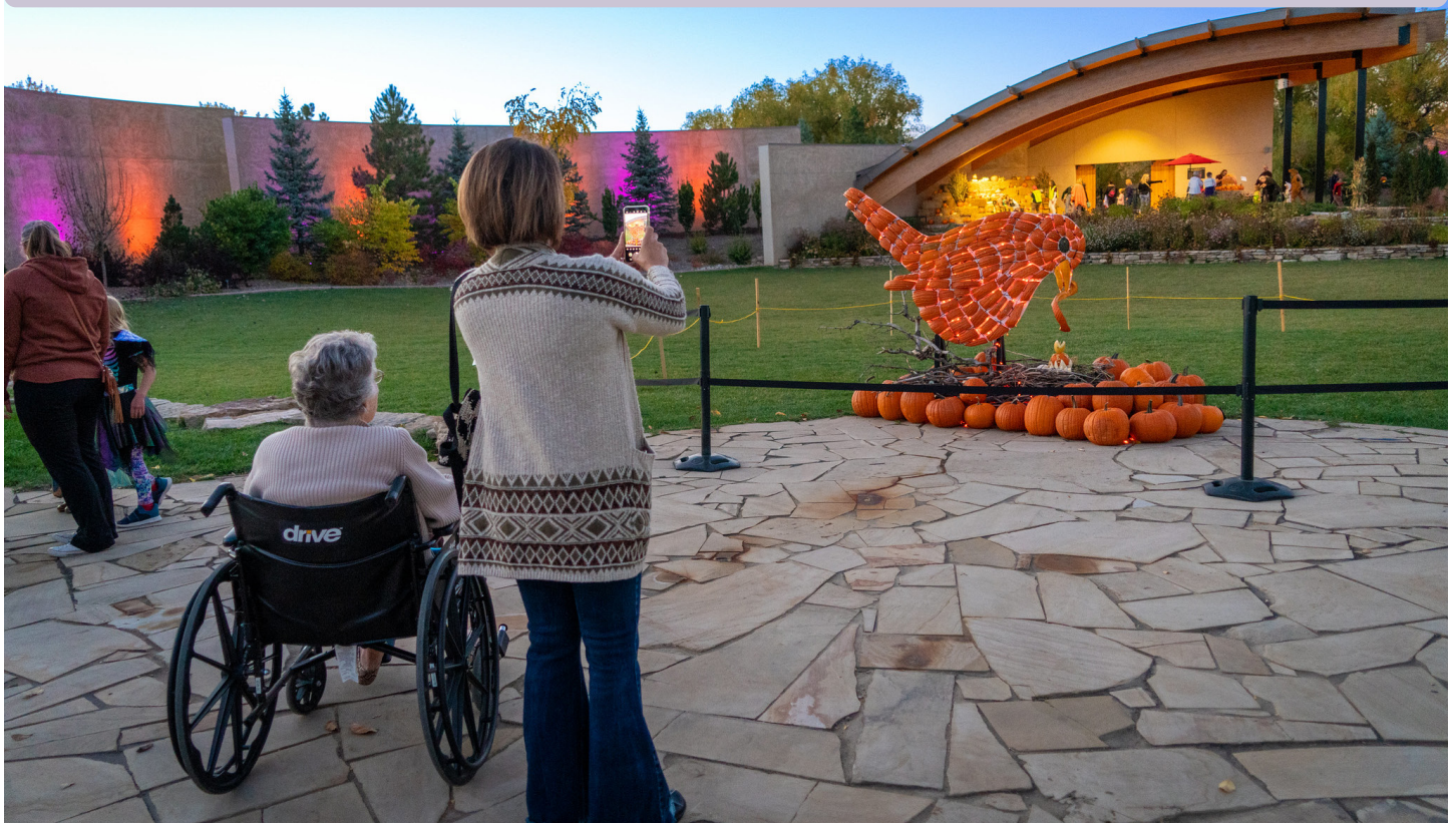
Patrons of the Gardens on Spring Creek admire a pumpkin sculpture during the 2022 Pumpkins on Parade event.

Based on continued community and staff feedback , and while also acknowledging advances that have been made in the diversity, equity and inclusion space this year, it remains clear the City must continue focusing, refining and applying an equity lens to service delivery and throughout our community via culturally sensitive community engagement, strategic planning and budgeting processes to demonstrate how the City is dedicated to improving the lives of all community members.