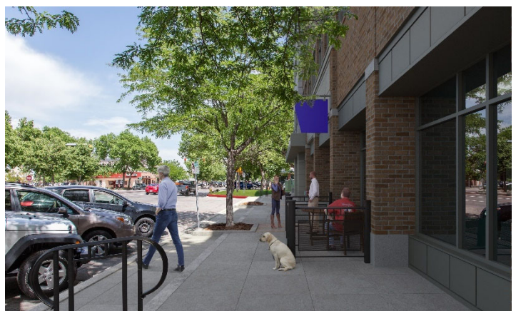
Proposed Mountain Avenue Streetscape

The City of Fort Collins will make reasonable accommodations for access to City services, programs, and activities and will make special communication arrangements for persons with disabilities. Auxiliary aids and services are available for persons with disabilities. V/TDD: Dial 711 for Relay Colorado.