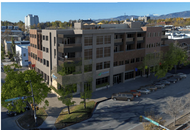
Proposed Development Looking Southwest at Mountain/Mathews Intersection