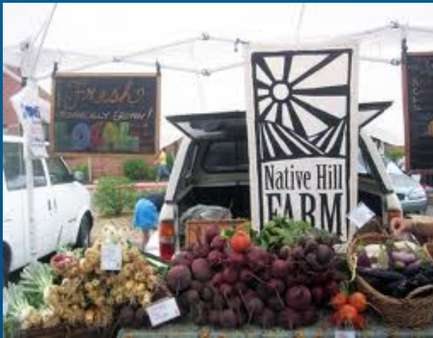
Native Hill Farm – Farm Stand

Events that occur on a regular basis in the same location, but may only occur during the growing season and often considered temporary uses.