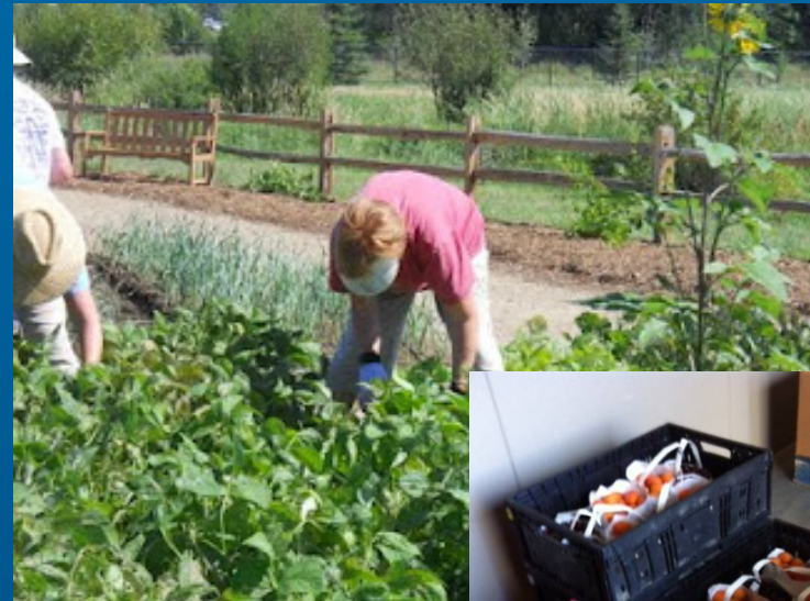
Above: Gardens on Spring Creek