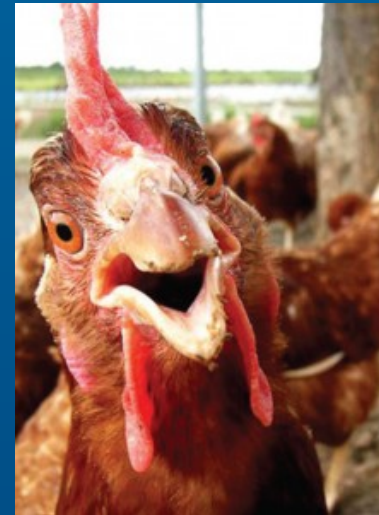
Rocky Mountain Sustainable Living Association