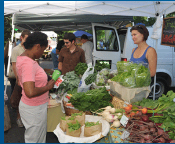
Fort Collins Farmers Market (Alison O'Connor)