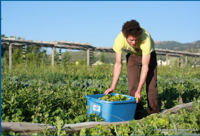
Happy Heart Farm

Gardens or orchards where food is grown to be sold, can include produce sold at the site or distributed to pickup locations.