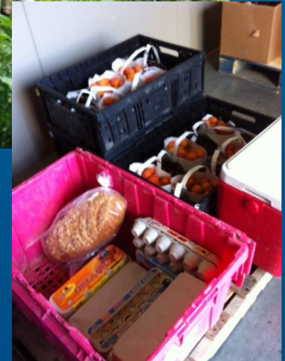
Right: Produce from Grant Family Farms