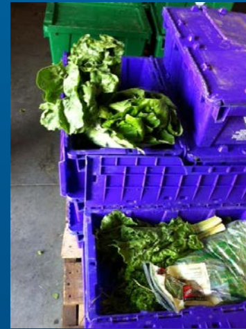
Food distribution site at the Fort Collins Brewery (Photo: Dan Weinheimer).