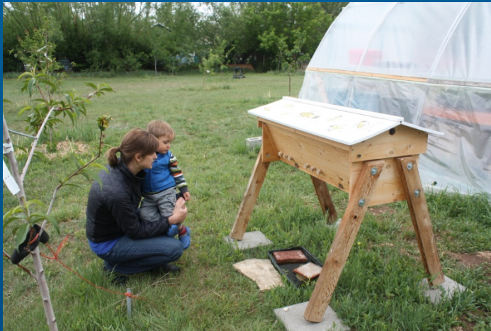
Beehive at the Mulberry Community Gardens.

Includes raising bees and a variety of animals in residential and commercial areas. The purpose is to produce food from animals, e.g., eggs, milk, honey, etc.