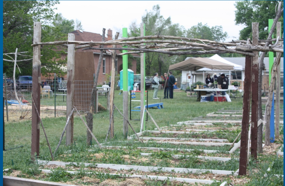
Mulberry Community Garden – Celebration May 2012

Gardens where several individuals or households work at the site and the food is primarily used for personal consumption and/or donation.