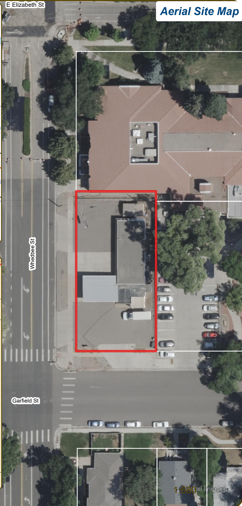
Aerial Site Map