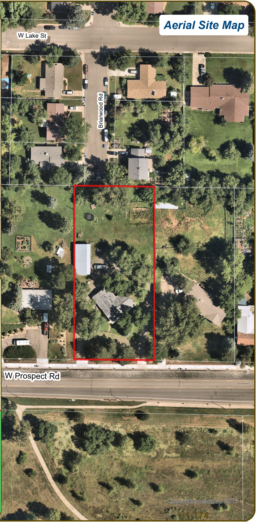
Aerial Site Map