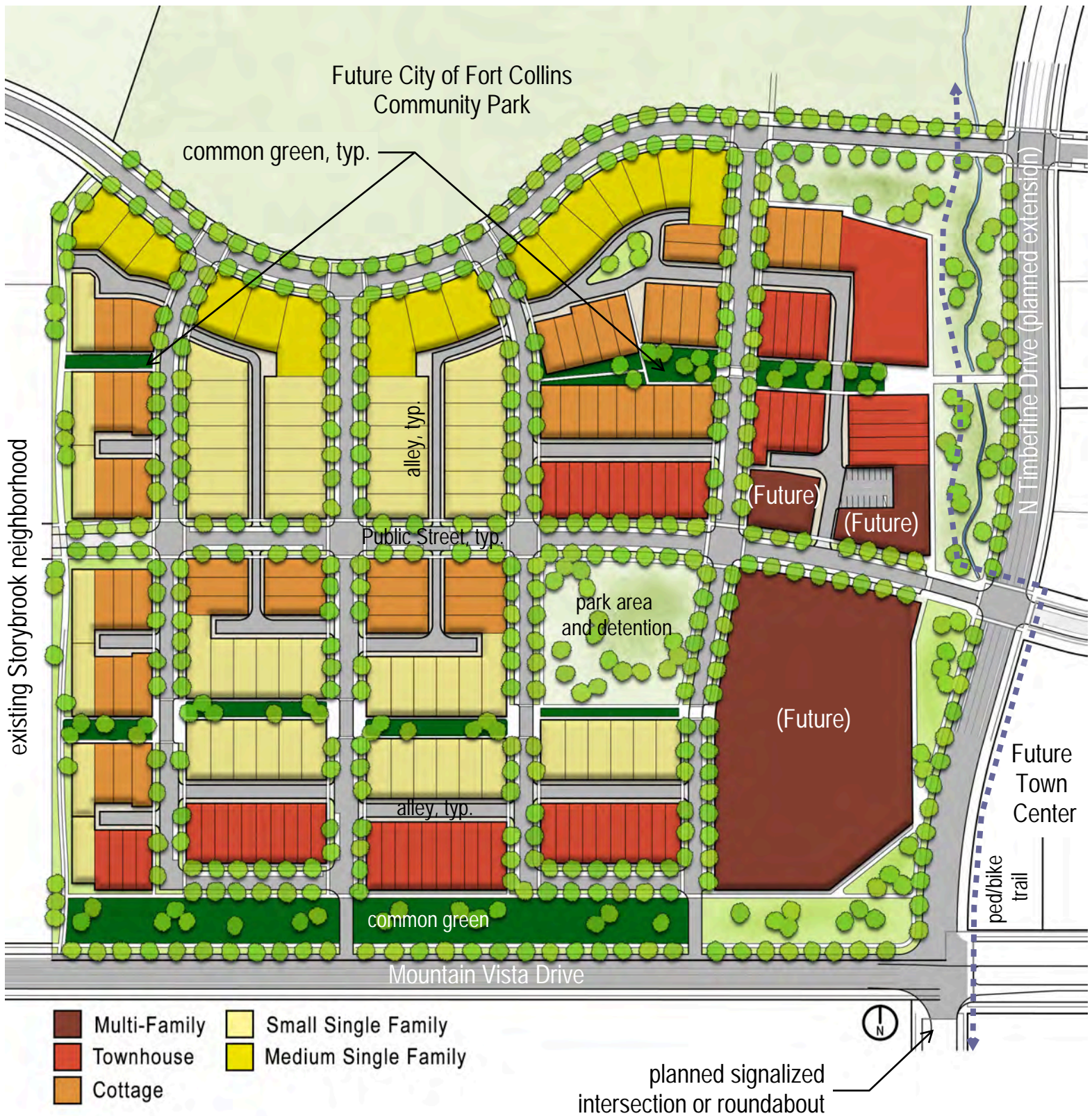
Montava - Phase 1a Concept Plan