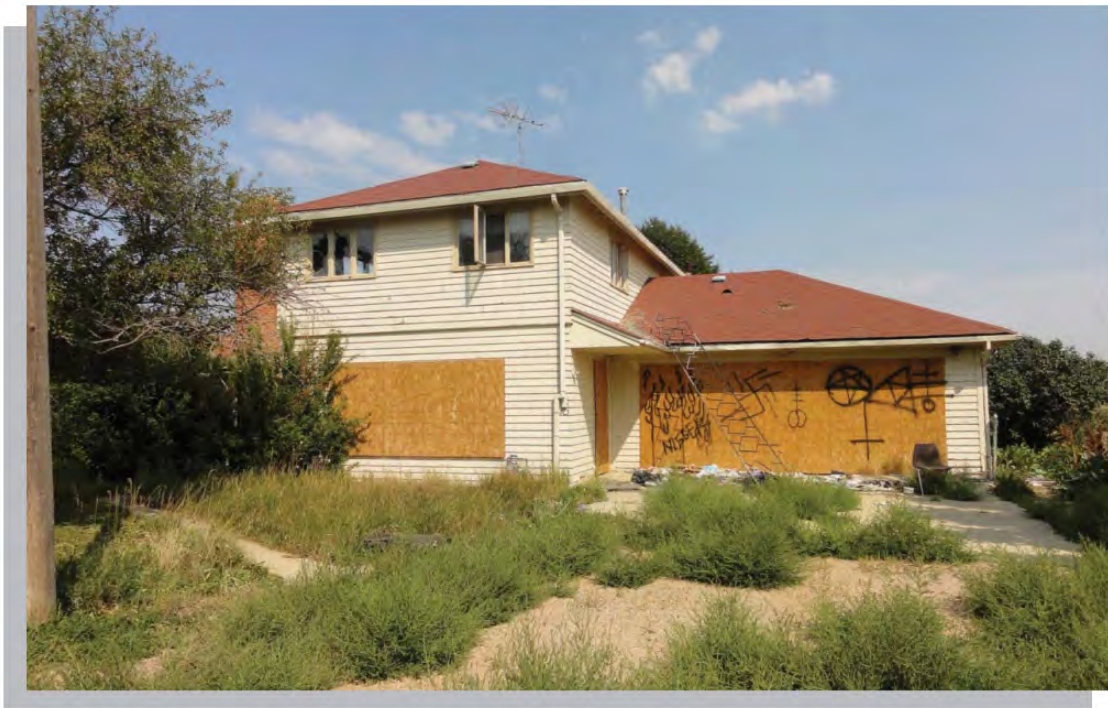
Photo 1 - Looking east at the vacant residence on Parcel 6.