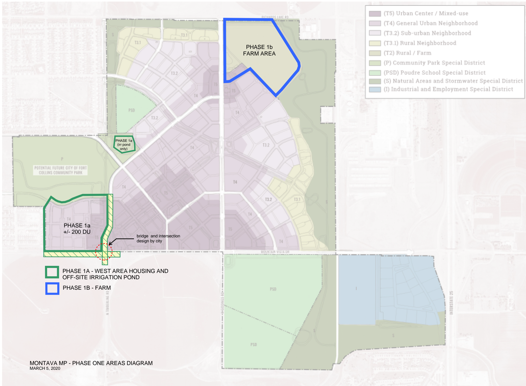
MONTAVA MP - PHASE ONE AREAS DIAGRAM MARCH 5, 2020