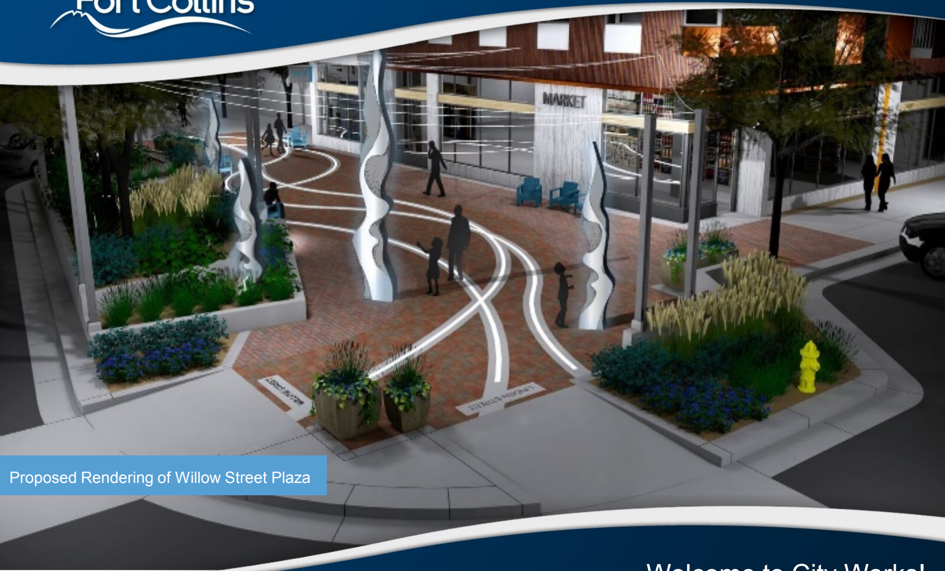
Proposed Rendering of Willow Street Plaza

Welcome to City Works! City of Fort Collins Engineering Department