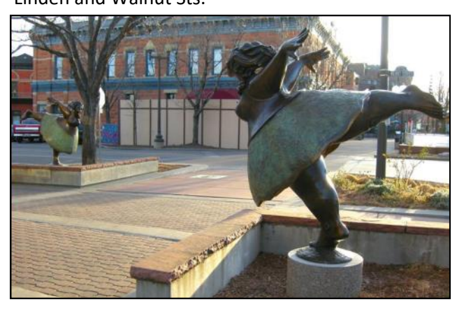
On the southeast corner:

Artist: James Lynxwiler Free To Dance Art in Action Project 2010 Corner of Walnut and Linden Streets