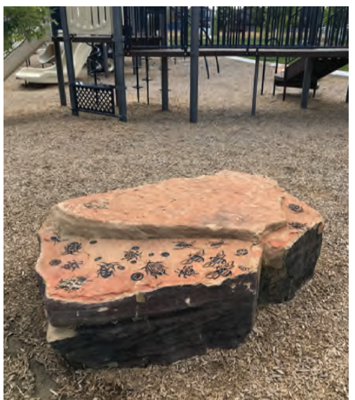
Insects (above) play an important role. Ladybugs symbolize good luck, because it eats pests. The beetle represents regeneration, new life emerging from the earth. Butterflies are also a symbol of rebirth, immortality, and joy.

For more information, fcgov.com/artspublic