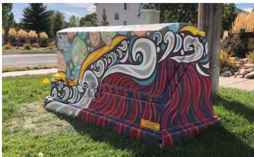
Abstract Weather Celebration Alison Dickson 2019 NW corner of Mainsail Dr. and Turnberry Rd.

The retaining wall on the west end of the tunnel displays a scene of the prairie depicting the mid-1800s when this area was the hunting domain of native tribes. Bison are shown roaming in large herds, and pronghorn were present then as well as today.