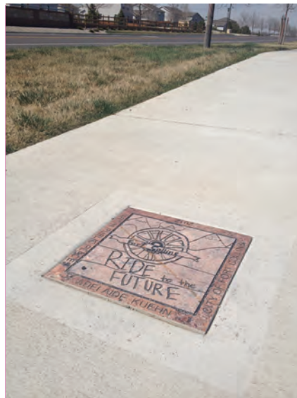
One of fourteen Pedestrian Pavers along Turnberry Rd.