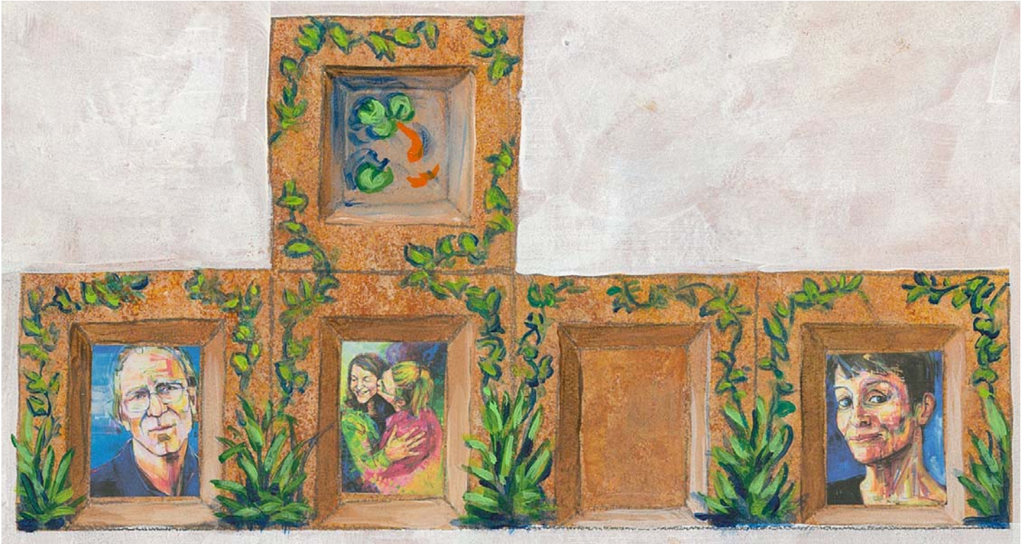
Transformer Cabinet Mural 1: Portraits will be painted in all 4 side alcoves, portraits shown as examples only.