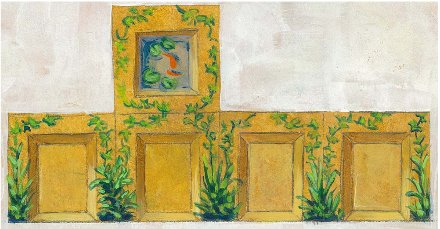
Transformer Cabinet Mural 2: Portraits will be painted in all 4 side alcoves.